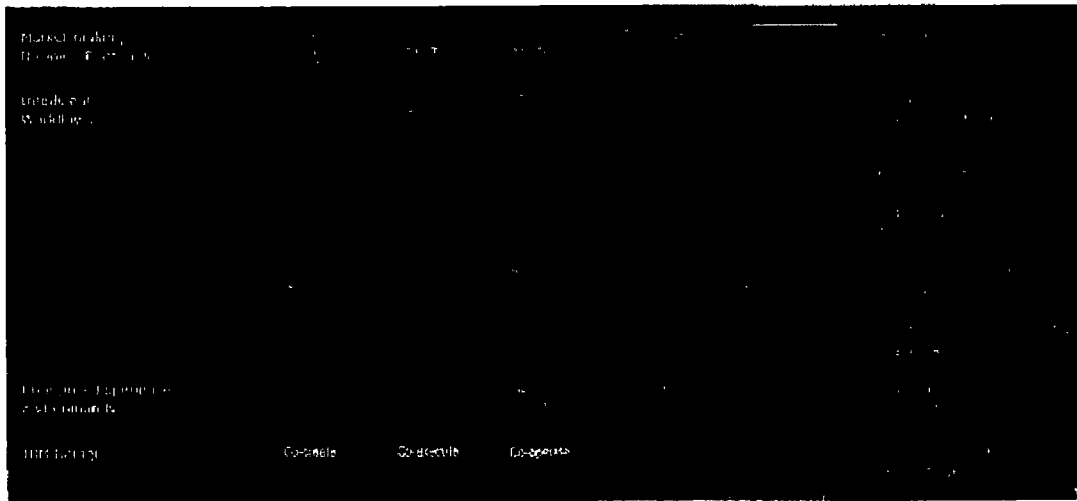
Figure 1. IBM Cognitive Enterprise for ACCESS Harris

ecosystem at scale. Figure 1 serves to illustrate aspects of an open data platform for the creation of a Cognitive Enterprise: