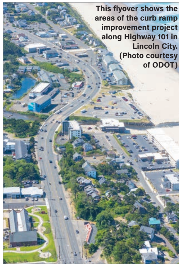
This flyover shows the areas of the curb ramp improvement project along Highway 101 in Lincoln City.