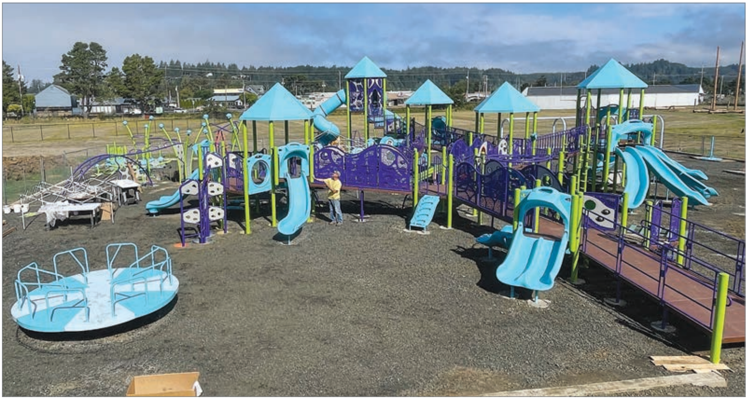
To give some perspective as to the size of the new playground structure in Waldport, one of the volunteers, Steve Corwin, stood next to it for a photo on Saturday. It will take some time yet before the playground is ready for use, but city officials hope it will open some time in October.