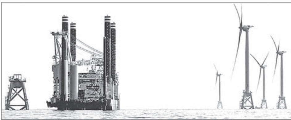
The two projects would include large devices placed offshore of Coos Bay and Brookings along the southern Oregon coast, designed to capture the wind for energy development.