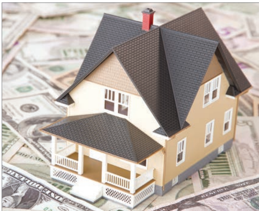
Oregon Housing and Community Services plans to make its final Homeowner Assistance Fund payments in February 2025, but funds may run out much sooner.

Homeowners wanting to apply for assistance must work with a HAF intake partner to submit an application on their behalf. A list of intake partners can be found at https://www.oregon.gov/ohcs/homeownership/Pages/Homeownership-Assistance-Fund.aspx .