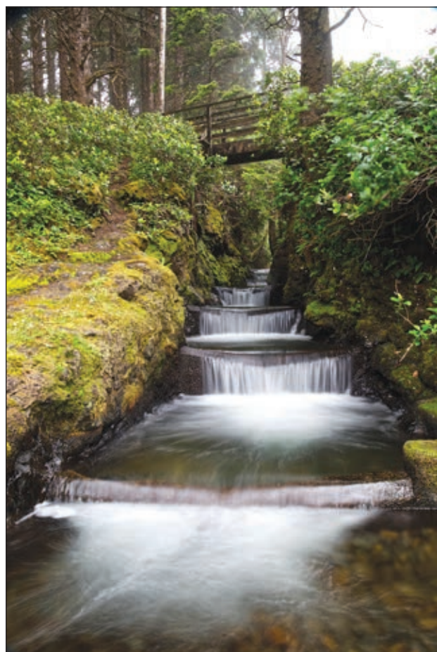
Photographs by Herb Keatley are being featured in a spotlight show at the Yaquina Art Association Gallery in Newport. Also featured are paintings by Jeff Bertuleit.

Keatley likes to create and capture images using various photographic methods, media and techniques. He works with both digital and film media, using various cameras and devices to achieve the desired results. People will see images captured and processed using both film and digital methods. For inspiration, he looks to many different sources — nature, the works of the industrialized world, and the works of many photographers, past and present, well known and