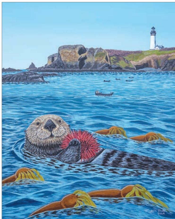
This artwork by Megan Pros is included in the online silent art auction being held by The Elakha Alliance in conjunction with its “Seas the Night” event set for Saturday, Sept. 28.