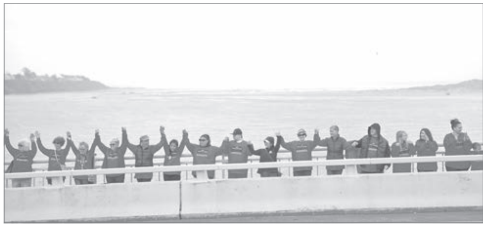
In recognition of National Recovery and Wellbriety Month, people are invited to take part in “Hands Across the Bridge” in Waldport at 11:30 a.m. this Saturday. Pictured are participants from a previous year’s event. (File photo)

Oregon groups opposing the development said the offshore wind facilities will be built in the pristine ocean ecosystems that support remarkable marine biodiversity, including many protected species. No environmental studies have been performed to assess the risks of large-scale offshore wind energy production, which risks overwhelming this unique remote ocean region, according to the opponents.