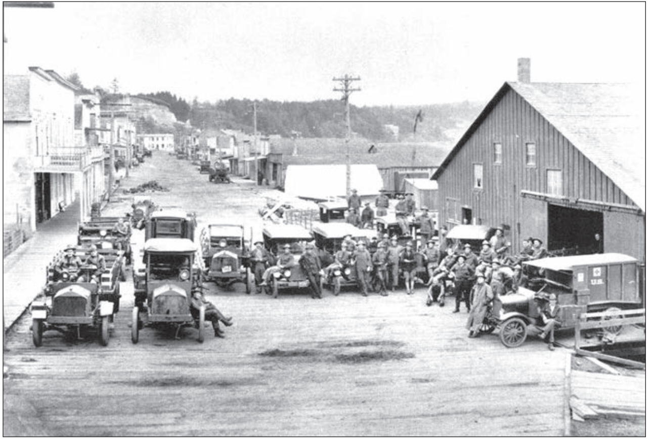
More than 3,000 soldiers and civilians poured into Lincoln County during World War I to build the infrastructure for a massive spruce logging venture to make lightweight lumber for airplane construction. Buildings were taken over to use during the operation, including structures on the Newport Bayfront that served as administrative offices and a drafting room. This photograph was taken around 1918.