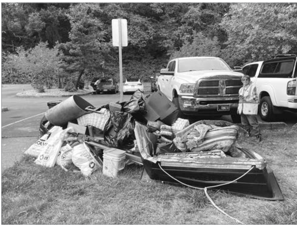
The MidCoast Watersheds Council is sponsoring the annual Salmon River Cleanup from 9 a.m. to 2 p.m. on Saturday, Sept. 28.