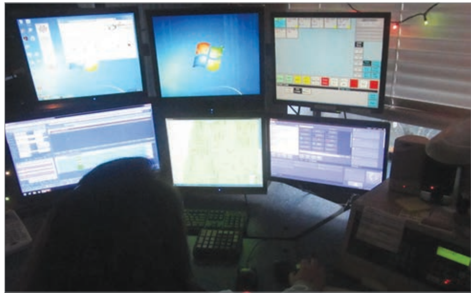
Lincoln City authorities use this dispatch center at the Lincoln City Police Department to monitor emergency events and notifications.