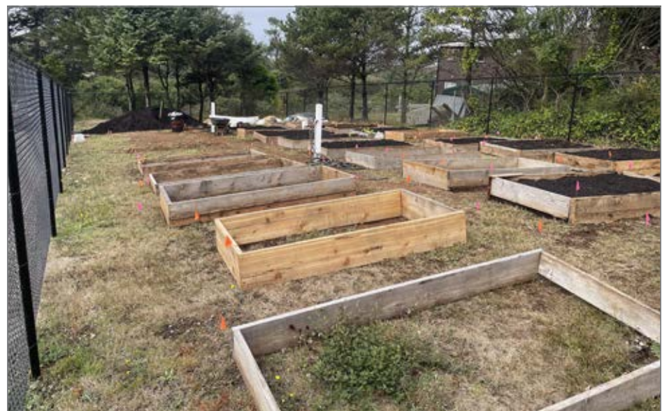
The Juntos en el Jardin (Together in the Garden) project on the north side of the Newport Public Library is moving forward, with raised garden beds now being installed.