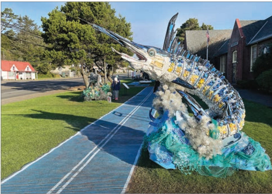
The Oregon Coast Aquarium in Newport will receive $35,456 in Oregon Cultural Trust grant funding to support ocean literacy and environmental education by hosting the Washed Ashore project. This is one of the sculptures that was on display when the traveling exhibit was located at the Lincoln City Cultural Center. (File photo)