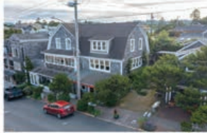
232/222 NW Coast St. Newport, OR 97365 MLS #22-1415 $1,850,000