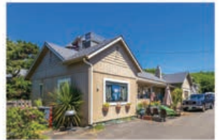
533 SW 34th St. 2 units | Lot: 2,614 S/F MLS #22-1682 | $449,000