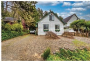
2744 SW Coast Ave. 2 bed, 1 bath | MLS #22-1074 $407,000