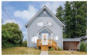
514 SE Elder St. Toledo, OR 97391 MSL #22-1715 $450,000