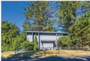
3217 NE Tide Ave. Multi Family | Lot: 5,663 S/F MLS #22-1681 | $625,000