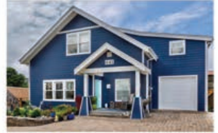
441 NW Hurbert St. Newport, OR 97365 MLS #22-1444 $849,000