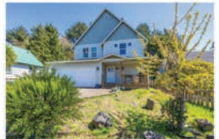
2750 SW Coast Ave. 3 bed, 2 full, 1 partial bath | MLS #22-1322 | $625,000