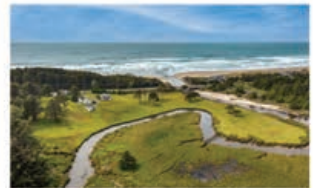
8622 Highway 101 N Yachats, OR 97498 MLS #22-1037 $998,000