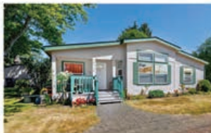
1112 NE Fogarty St. Newport, OR 97365 MLS #22-1672 $425,000