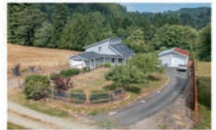
7368 Logsden Rd. Logsden, OR 97375 MLS #22-1735 $635,000