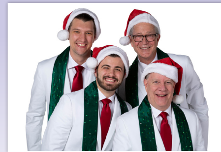
The Diamonds December 22, 2019 • 2:00pm