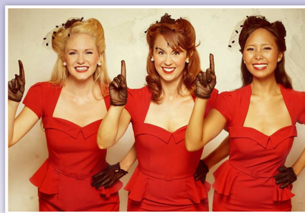
America's Sweethearts October 20, 2019 • 2:00pm

Don Whitney Auditorium Tillamook High School