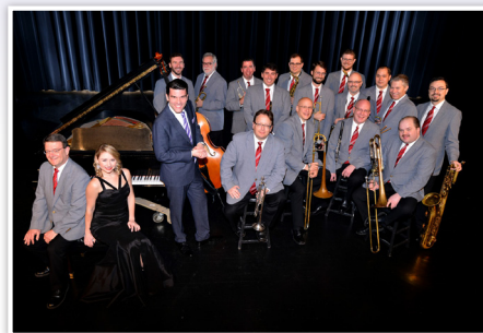
The Glenn Miller Orchestra March 22, 2020 • 2:00pm