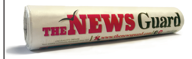
Lincoln City's largest and most trusted news source.