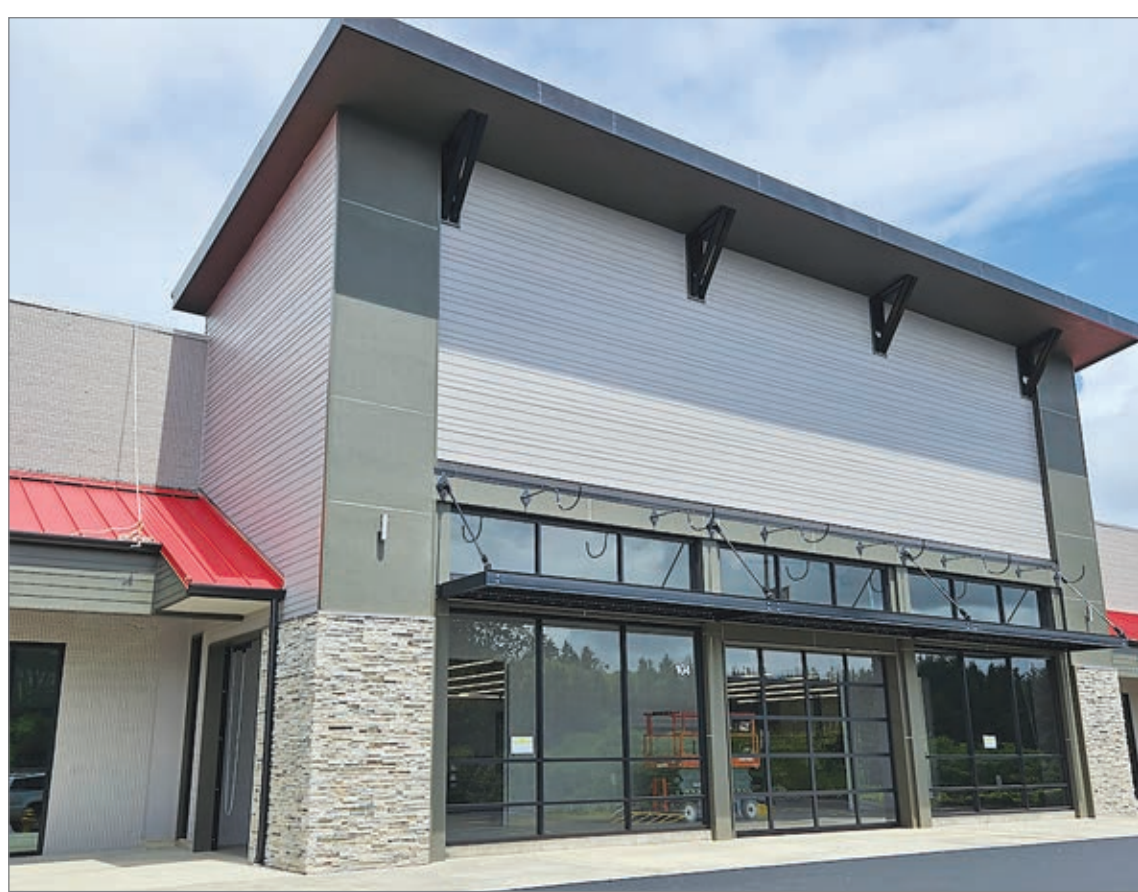
The new 1st Choice Fresh Market will be located in Lighthouse Square at 4157 NW Highway 101 #104 in Lincoln City.

“We’ve done some roofing, refurbishing of the buildings, painting, mainly aesthetic remodeling, getting the parking lot ready for business at the grocery store, and changing the lighting,” he said. “There’s