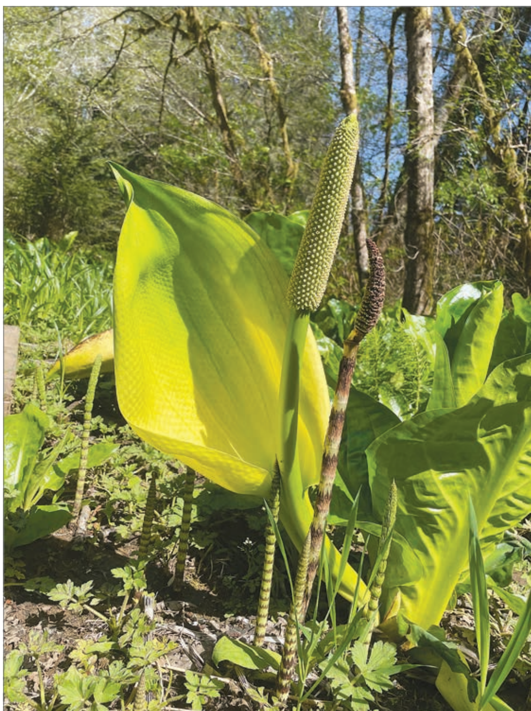
With spring weather comes the blooming of skunk cabbage ( Lysichiton americanus ), a native plant in Oregon that is commonly found in wet areas like bogs and marshes. It's also known as "swamp lantern" due to its bright yellow flower and large leaves. The plant is notable for its strong, skunky odor, which helps attract pollinators like flies and beetles.