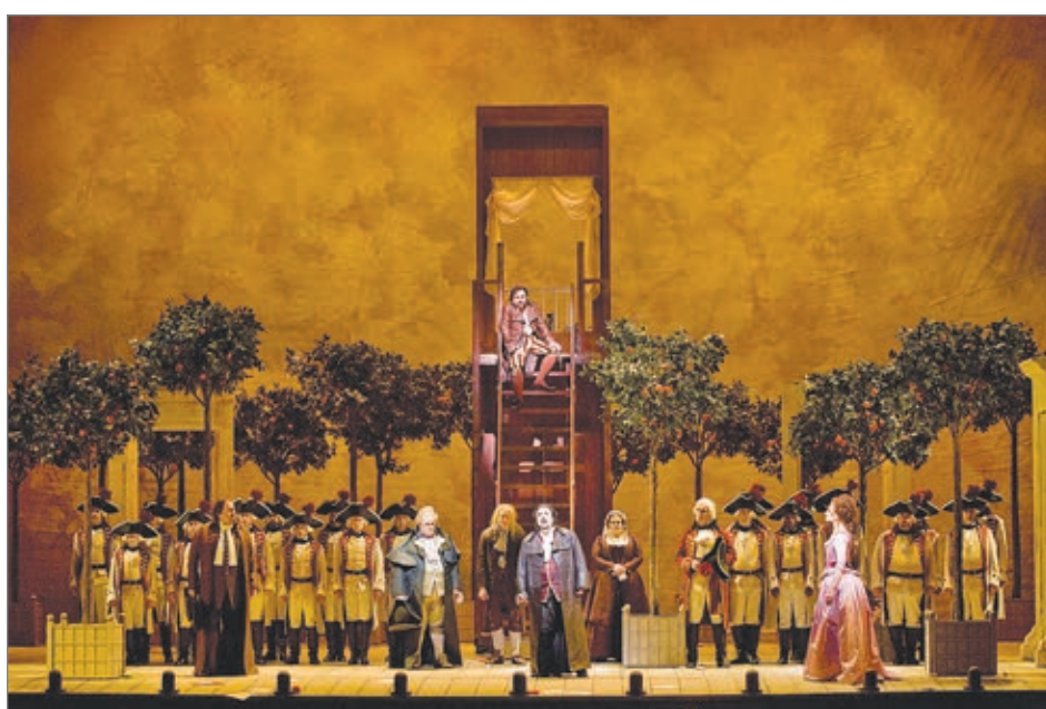
The Metropolitan Opera will livestream Il Barbiere di Siviglia to the Alice Silverman Theater at the Newport Performing Arts Center beginning at 10 a.m. on Saturday, May 31.

This presentation is part of the Met's award-winning "Live in HD" series, which brings world-class opera to screens across the globe with better-than-front-row angles and glorious sound. The production, sung in Italian with English subtitles, will be streamed live from the Metropolitan Opera stage