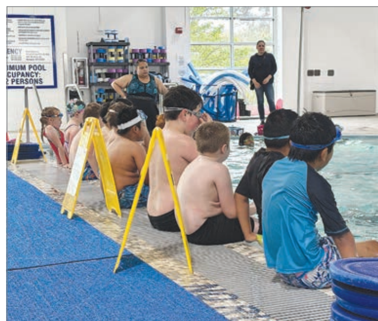
Yaquina View Elementary second graders get ready to jump in the pool for swimming safety lessons at Newport Parks and Recreation.

Theatre West is located at 3536 SE Highway 101 in Lincoln City.