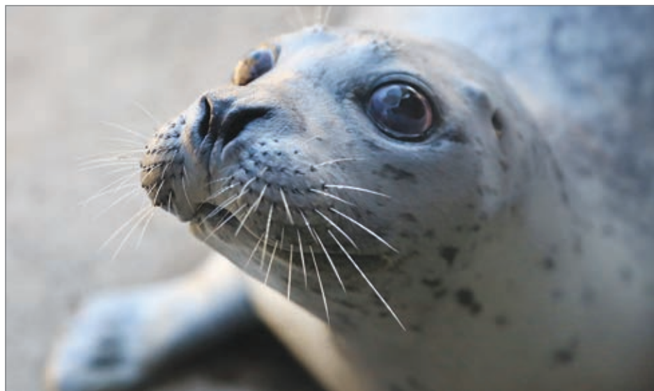
Skinny, a longtime resident of the Oregon Coast Aquarium, will soon be turning 50, and a public celebration is planned to mark the occasion.

To learn more about the event or to sponsor Skinny's birthday, visit aquarium.org/skinny-turns-50 .