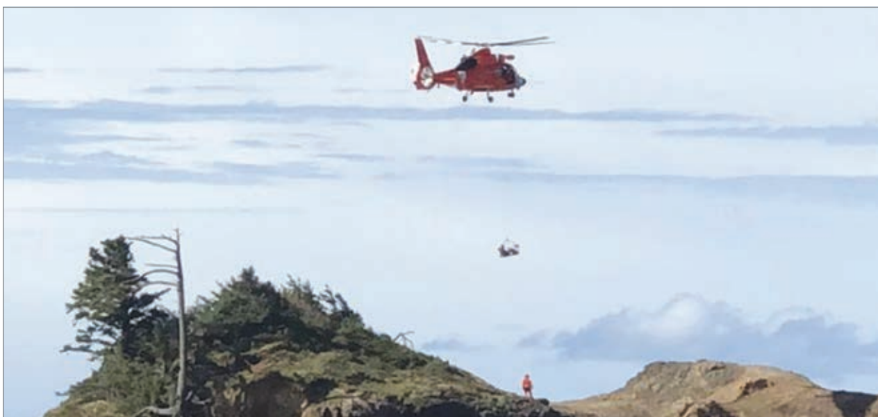
Two people are pictured being lifted from God's Thumb during a previous rescue in March of 2018. First responders urge hikers to know the dangers of where they are going and be prepared for any weather or terrain challenges.