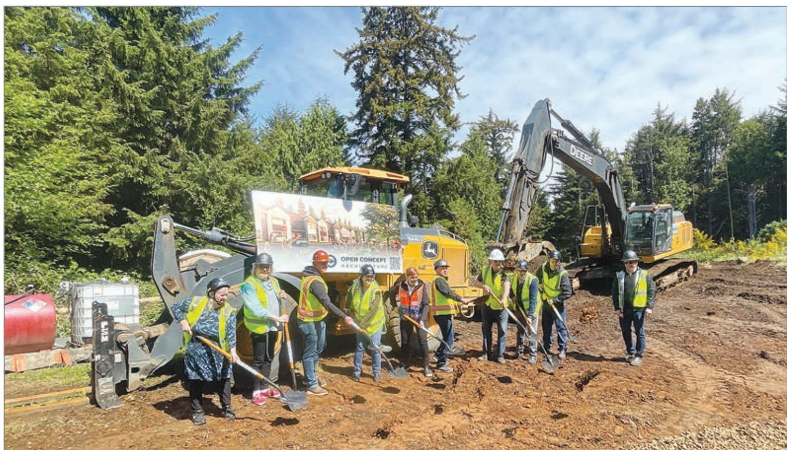
Construction of the 12-unit Depoe Bay Townhomes project was kicked off with a groundbreaking ceremony on the morning of Tuesday, May 20.