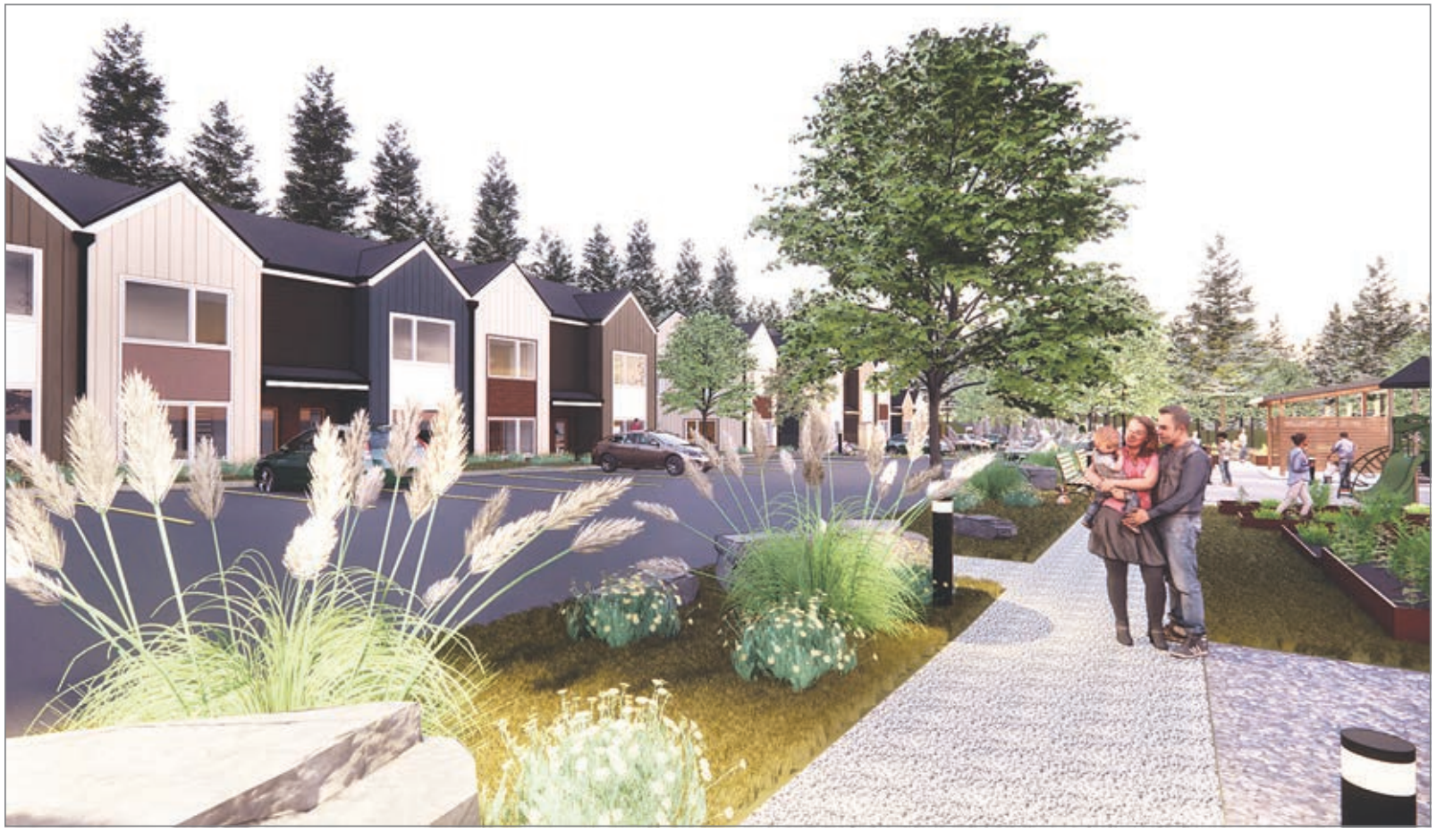
This artist rendering shows the concept for the Depoe Bay Townhomes, which will include 12 units of affordable housing. The project is owned and will be managed/operated by the Housing Authority of Lincoln County.