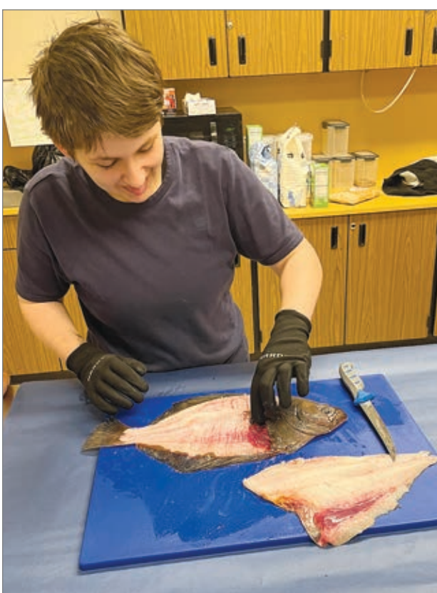
In a seafood butchery class, a student at Clatskanie Middle/High School learns to fillet petrale sole.