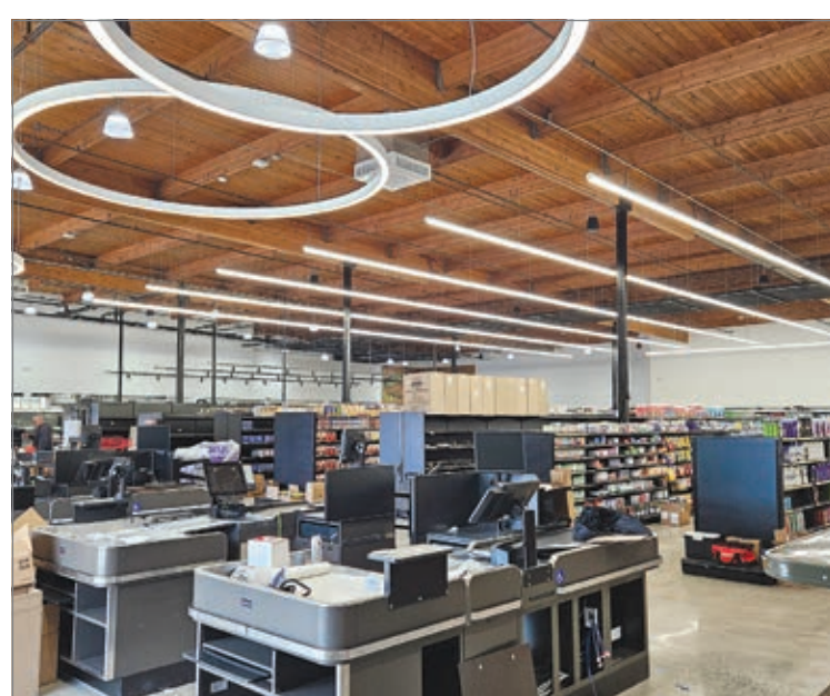
High-quality specialty and local products, as well as national brands everybody loves, will be available at 1st Choice Fresh Market, which will be opening soon in Lincoln City.