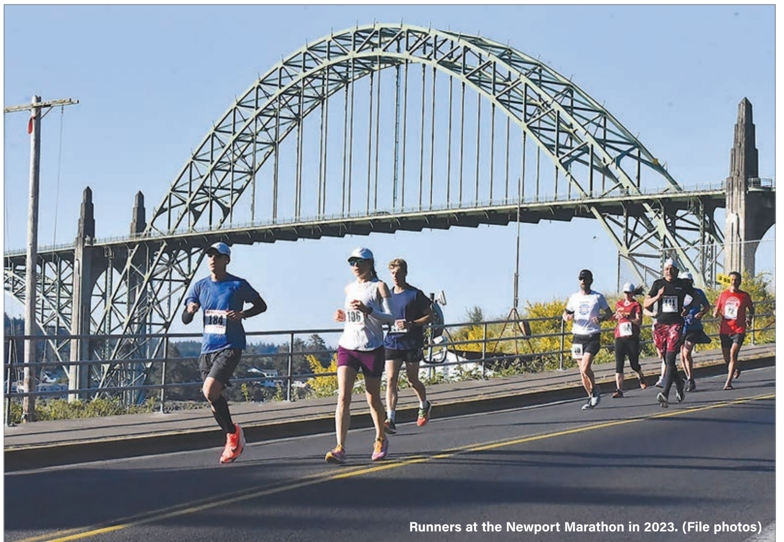
Runners at the Newport Marathon in 2023. (File photos)

The marathon is a 26-mile loop that starts at the "haunted" lighthouse at Yaquina Bay State Park, where runners will start north along the ocean through the town of Newport before running Yaquina Bay Road until the turnaround at mile 15. The half-marathon has the same start and finish location, but the turnaround is at mile 8.7. Aid stations will be provided for participants about every two miles on the course.