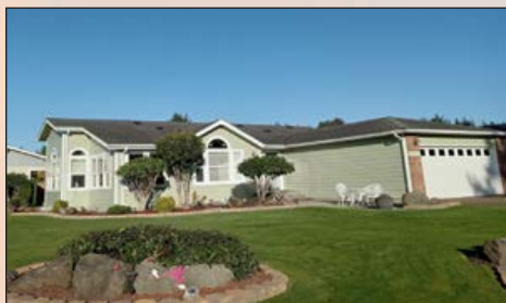
23-96 1170 SW Ocean Hills Drive, Waldport 3 bedroom 2 bath 1924sqft $445,000

Ocean view lot across from Smelt Sands Park, 804 Trail and ocean waves. Zoned R3 (Single Fam/Dup/Multi-Fam), ready for you to add a home or invest in rentals. Verify building code and future uses with City. A unique combination within Yachats city limits, PLUS the Owners may consider carrying contract for up to five years, with $50,000 down and approved credit.