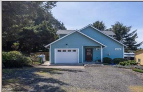
23-768 60 E 7th Street, Yachats 2 bedroom 2.5 bath 1622sqft $744,800

205 E. Olive Street, Newport, OR 97365 • 541-265-2200