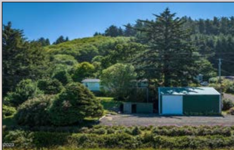
23-531 1746 Highway 101 N, Yachats Shop with building lot 900sqft $345,000