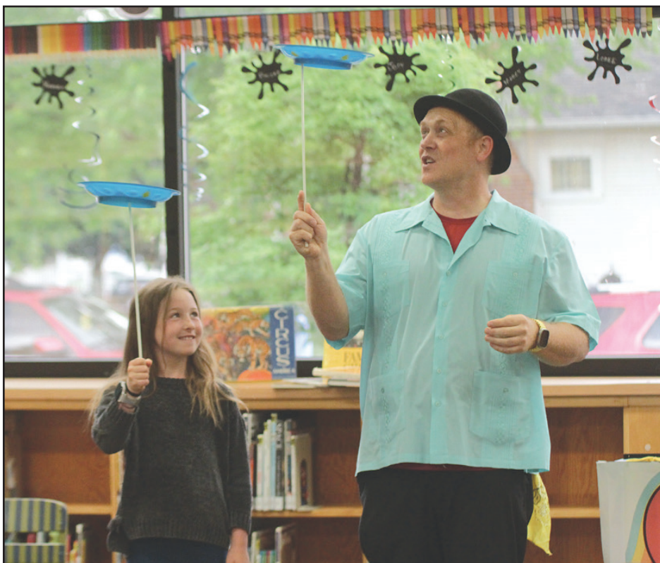
The summer months of 2025 were full of celebrations and achievements in Kearney County. The Minden Opera House celebrated its 25th anniversary in May with two days of events including a performance by 'Oh My Gosh It's Josh!'. The circus performer also performed at area libraries and Harold Warp Pioneer Village while he was in town.

Warm, sunny weather provided a perfect day for the Minden Chamber of Commerce Dawg Days event. Residents hunted down deals at citywide garage sales in the morning before