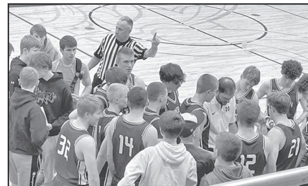
The Minden boys basketball team season came to an end in the C1-8 subdistrict play at Gothenburg on February 24. The Whippets' final record was 13-10.