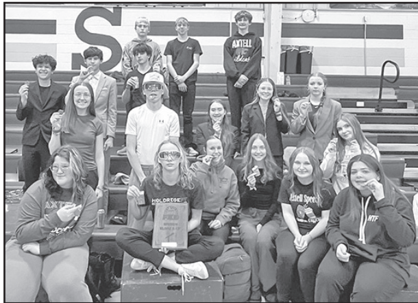
AXTELL SPEECH TEAM

Axtell novice results from Voices of the Plains Invite: