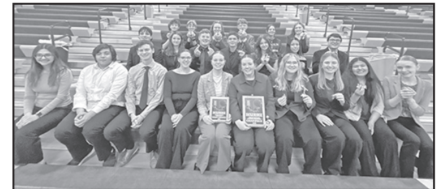
MINDEN SPEECH TEAM

The Minden Speech team concluded its regular season at the Voices of the Plains Invite at Holdrege on February 28. The Whippets swept the competition earning first place as a team ahead of Holdrege. Additionally, the team earned 30 medals out of 38 entries that competed.