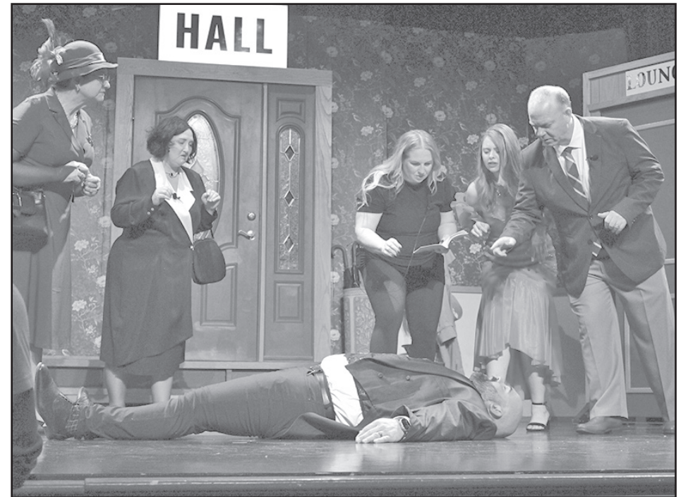
Actors rehearse a scene in the Minden Community Players' upcoming production of 'Clue'. Tickets are on sale now for shows March 6-22 at Minden Opera House.

Follow Minden Community Players on Facebook and Instagram for news about upcoming productions. Audition for the next show and the spotlight could be on you.