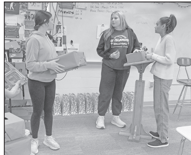
Linguistics 8 students prepare for the red carpet premier of the 2026 CLJMS short film 'Outside In'. The event will be held on Tuesday, March 17 at Minden High School.

The red carpet event will begin at 6:30 p.m. in the high school commons area with photos, refreshments, raffles, a VIP experience, gifts, and more. The movie will premier at 7:15 p.m. in the MPS Auditorium. A free will donation will be accepted at the door. If you are unable to attend, the evening will be streamed on their YouTube channel: Whippet Nation Network.