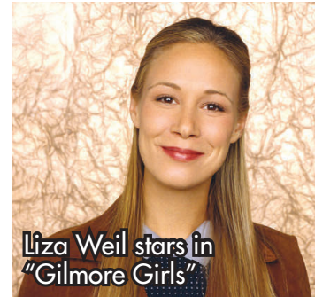
Liza Weil stars in "Gilmore Girls"

A: It's slated to be available to the stations that have carried it until fall, though Kelly Clarkson ("Stronger") may not always be hosting it. As happened when she took an extended absence from the program last year, guest hosts have appeared on certain days. With that being said, some stations are separating from the show earlier, in some cases launching their own local programs during the summer to fill the hourlong space that Clarkson's exit is leaving.