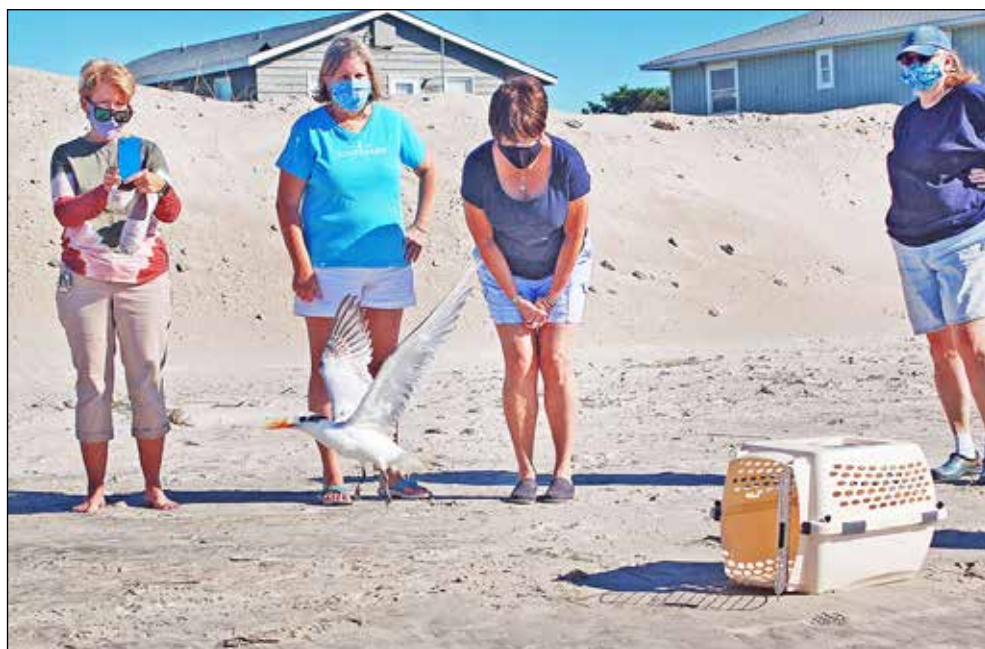
A royal tern is released on the beach by Sea Biscuit Wildlife Shelter.

The shelter's 15 clinical assistants and roughly 40 other volunteers have taken in a record 605 injured or sick birds so far this year, compared to 538 in 2019. The shelter is also slowly expanding and now has three flight cages, used for rehabilitation, at Bill Smith Park on the mainland. See Shelter, page 7A