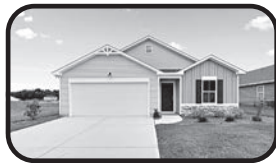
88 Ginter Park Rd, Supply

Brand new construction home located in Richmond Hills subdivision Supply conveniently right off 211. This home boasts 3 bedrooms and 2 baths, new construction, and new appliances, and a two-car garage. NO pets, NO smoking. $1800 per month.