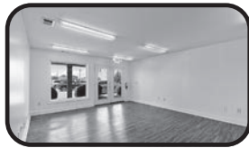
5016 East Oak Island Dr. Unit #2

Lovely 3-bedroom duplex conveniently located to Southport and Oak Island. Enjoy easy access to Long Beach and NC 211. Close to restaurants and shopping. NO pets NO smoking. $1950 per month.