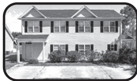
4426 Flagship Ave - Southport

Brand new construction home located in Richmond Hills subdivision Supply conveniently right off 211. This home boasts 3 bedrooms and 2 baths, new construction, and new appliances, and a two-car garage. NO pets, NO smoking. $1800 per month.