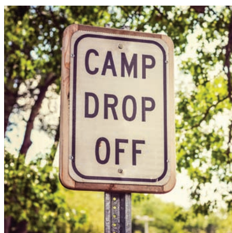
How to handle summer camp questions in the pandemic era