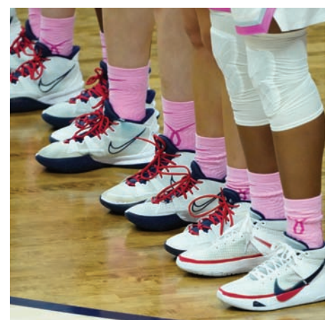
Black women with breast cancer at greater risk of dying than white women