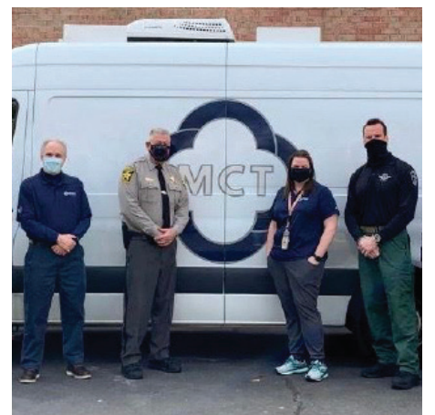
Calvert County crisis team putting mental health as a top priority