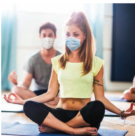
Health experts recommend a phased approach to resuming exercise after recovering from COVID-19