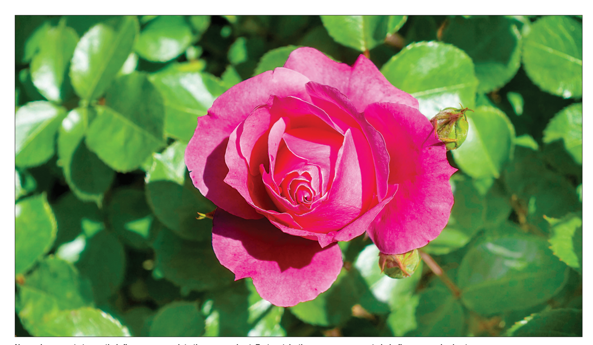
No gardener wants to see their flowers succumb to the summer heat. Fortunately, there are many ways to help flowers survive heat waves.