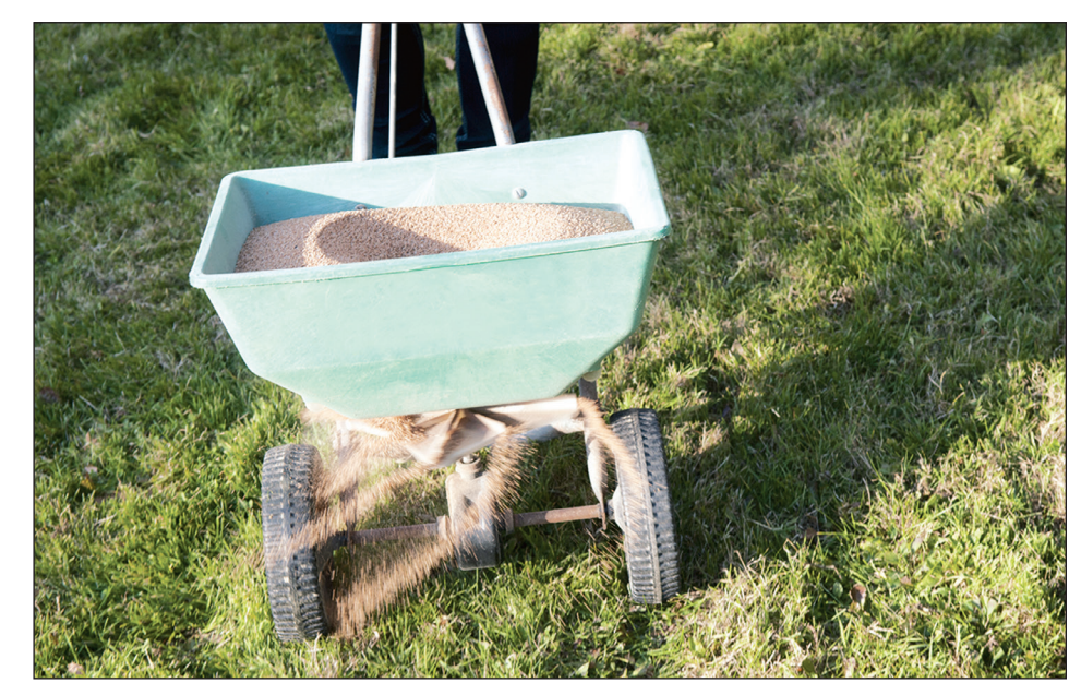
Overfertilization is an easy mistake to make, but it's a mistake that can have long-lasting consequences.

may be increasingly vulnerable to fungal disease.