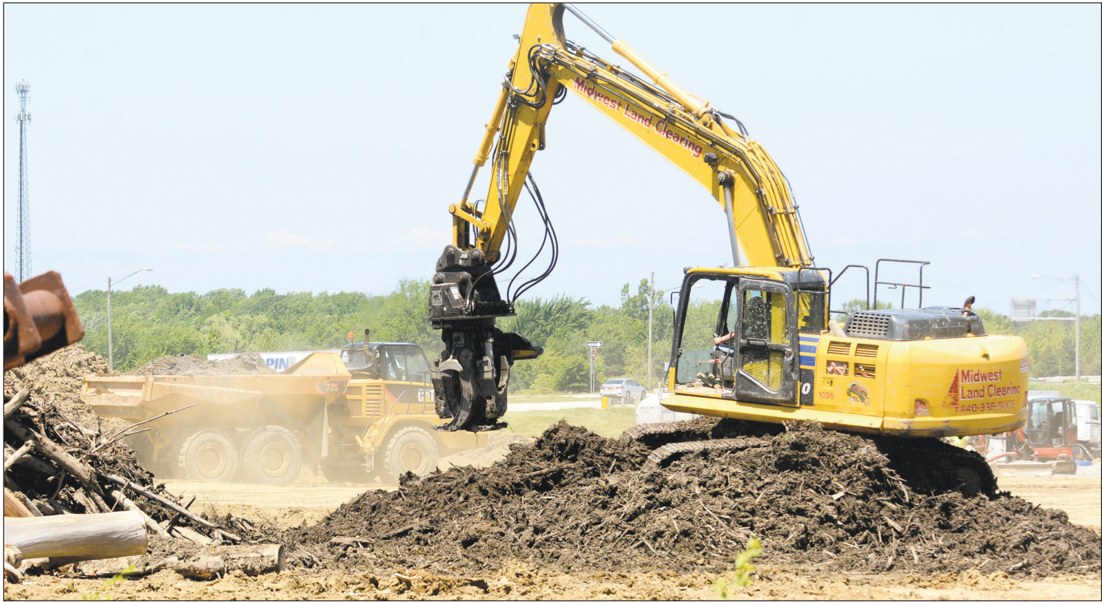
Land is cleared at the future site of Truck World near the intersection of Route 7 and Underridge Road in Conneaut.