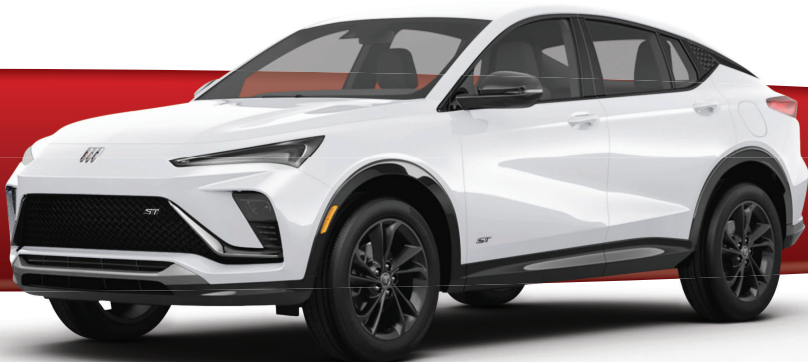
The ALL-NEW BUICK ENVISTA SPORT TOURING

WE HAVE OHIO'S LARGEST SELECTION OF PRE-OWNED CARGO VANS