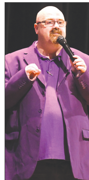
Warren Dillaway | Star Beacon

The festival celebrates grape growers, who harvest 1,500 acres of grapes annually.