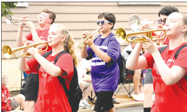
Members of the Geneva High School band perform during the 2024 Grape Jamboree parade in downtown Geneva.

The Madison High School band was one of more than 75 units that participated in the 2023 Grape Jamboree Parade in downtown Geneva.