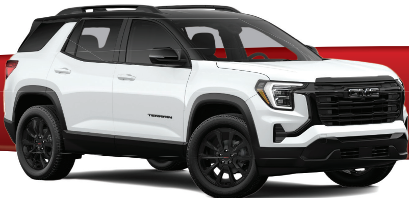
The ALL-NEW GMC TERRAIN ELEVATION