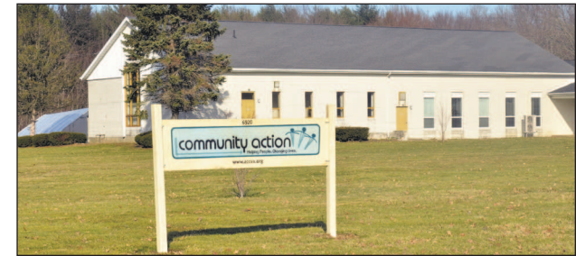
WARREN DILLAWAY | STAR BEACON

Priority is given to residents aged 60 years or older, households with high energy