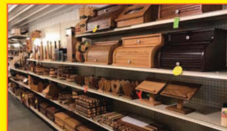
BREAD BOXES & LAZY SUSANS