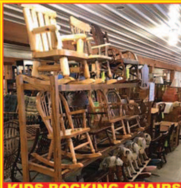
KIDS ROCKING CHAIRS AND HORSES