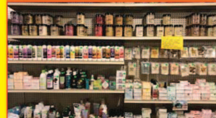
GIFTS & MORE!