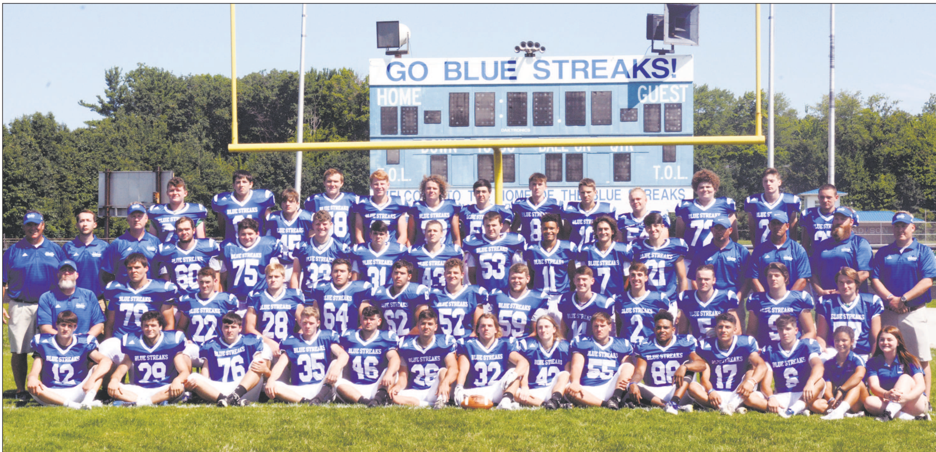
WARREN DILLAWAY | STAR BEACON

The Madison Blue Streaks are looking to turn around an 2-8 2017 season.