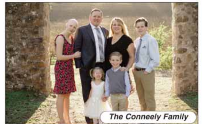
The Conneely Family

9074 Brooks Road South • Windsor 707-838-8883