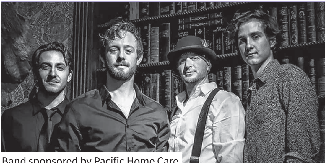
Band sponsored by Pacific Home Care