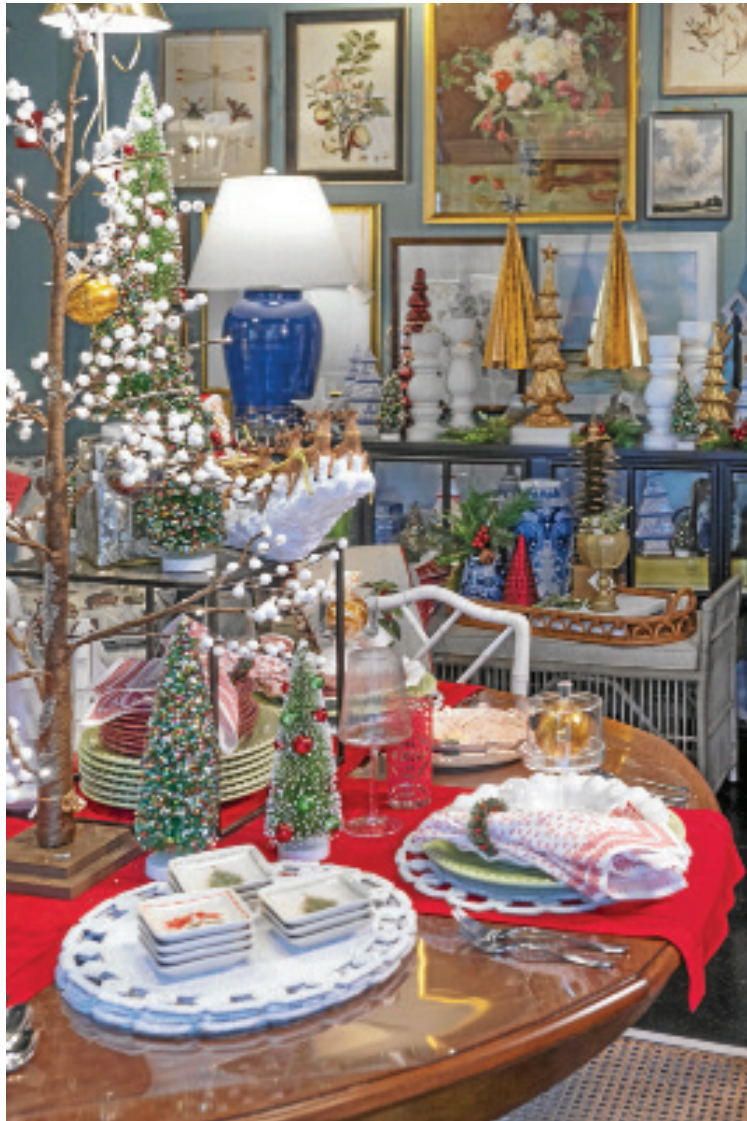
Many elements and textures come together to make this tabletop stand out.