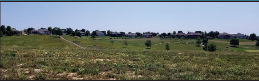
2644 Albatross Ridge $142,900

Story & 1/2, 1855 sq ft, 3 bedrooms, 2.5 bath, oversized 2 stall heated garage. Main floor primary suite with walk-in tile shower, double vanity & walk-in closet, open kitchen with island, and LR with fireplace, main floor laundry and guest 1/2 bath. Upper level has 2 large bedrooms with walk-in closets and full bath with double vanity and storage areas. Full basement with approximately 917 sq ft of future finish waiting for your ideas with rough ins for wet bar and another bath. Convenient Sioux City neighborhood and Sgt Bluff Schools. HOA $250 per month includes, Club House, fitness center & pool, snow removal, lawncare mowing/fertilizing, irrigation.