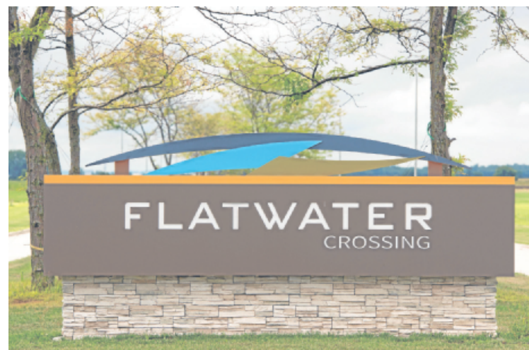
The entry to Flatwater Crossing in South Sioux City.