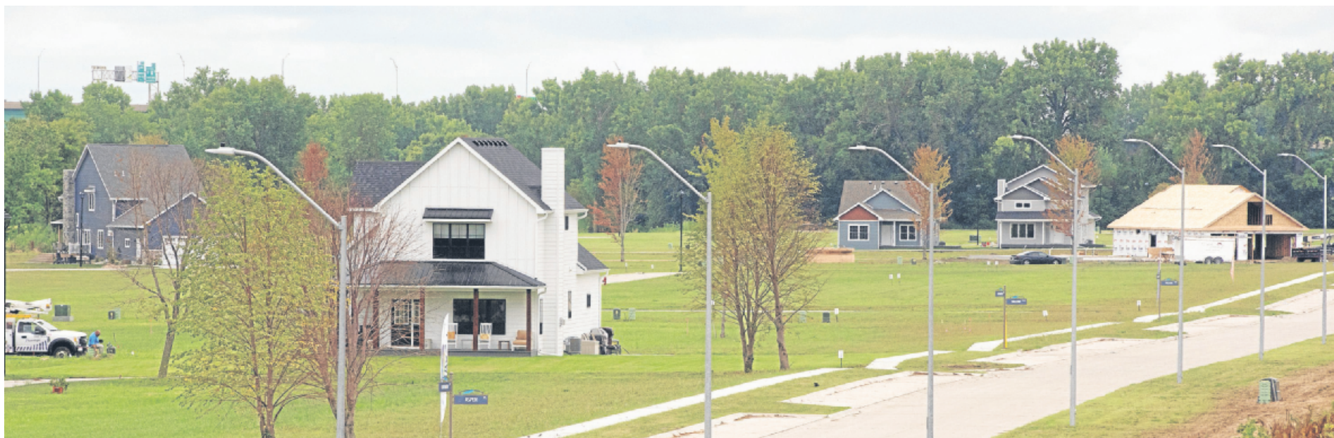
Homes, several under construction, are shown Aug. 12 at Ho-Chunk's Flatwater Crossing development in South Sioux City. The first phase of the $75 million project on the banks of the Missouri River calls for development of 67 lots that will have town homes, single-family homes, commercial space and roughly 200 apartment units.