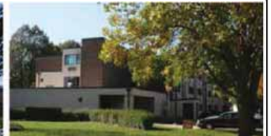
RIDGEWOOD APTS (36 units) 1 BR Apts 260 South 4th St. • Akron, IA. 51001 62 yrs of age or older or persons with disabilities.