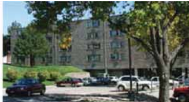
CENTURY II APTS (80 units) 1 BR Apts 515 Court St. • Sioux City, IA. 51101 62 yrs of age or older or persons with disabilities.