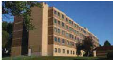
CENTENNIAL MANOR APTS (80 units) 1 BR Apts 441 West 3rd St. • Sioux City, IA. 51103 62 yrs of age or older or persons with disabilities.