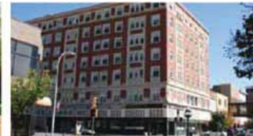
MARTIN TOWER APTS (86 units) 1 BR Apts 410 Pierce St. • Sioux City, IA. 51101 62 yrs of age or older or persons with disabilities.