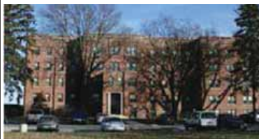
FLOYD VALLEY APTS (59 units) 1 BR Apts 110 6th Ave NE • LeMars, IA 51031