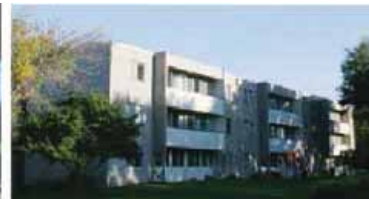
WEST PARK APTS (51 units) 1 BR Apts 605 W. 3rd St. • Sioux City, IA. 51103 62 yrs of age or older or persons with disabilities.