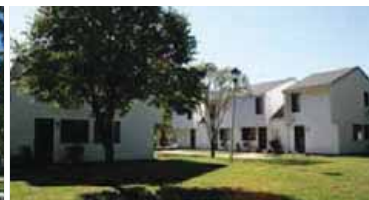
SOUTHVIEW APTS (32 units) 2 and 3 BR Apts 2728 South Helen St. • Sioux City, IA. 51106