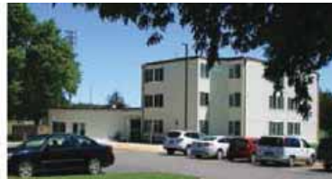
SOMERSET APTS (24 units) 1 BR Apts 400 Minnesota Ave. • Holstein, IA. 51025 62 yrs of age or older or persons with disabilities.