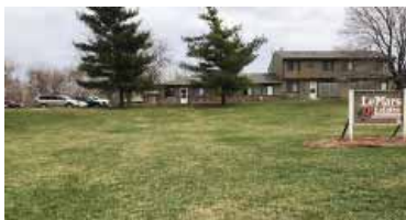
LE MARS ESTATES APTS ( 31 units) 2 and 3 bedroom town-home style apartments 650 4th Ave. NE • Le Mars, IA 51031