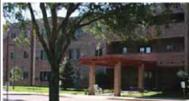
SHIRE I & II APTS (64 units) 1 BR Apts 4236 Hickory Lane, • Sioux City, IA 51106 62 yrs of age or older or persons with disabilities.