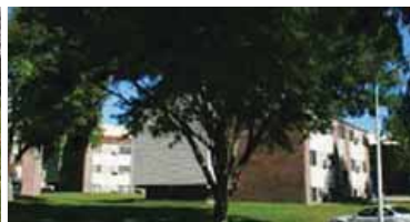
MORNING HILLS APTS (96 units) 1, 2, and 3 BR Apts 2627 South Rustin St. • Sioux City, IA. 51106