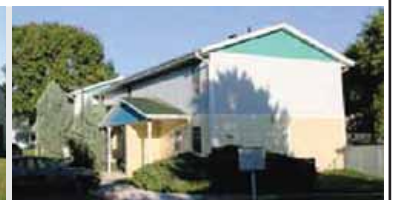
TOWNVIEW APTS (32 units) 2 and 3 BR Apts 400 West 4th St. • Sioux City, IA. 51103