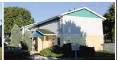
TOWNVIEW APTS (32 units) 2 and 3 BR Apts 400 West 4th St. • Sioux City, IA. 51103