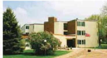
KINGSTON APTS (24 units) 1 BR Apts 315 E. 4th St. • PO Box 183 Kingsley, IA. 51028 62 yrs of age or older or persons with disabilities.