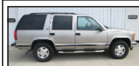
1999 CHEVROLET TAHOE AUTO, P/W, P/L, AIR TILT, CRUISE 712-540-4400