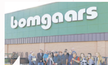
402 State Hwy 92 E, Winterset, IA