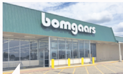
1111 N 2nd St, Cherokee, IA