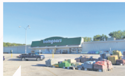
2803 E Kanesville Blvd, Council Bluffs, IA