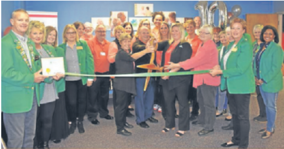
Chamber of Commerce SIGNIFICANT MILESTONE