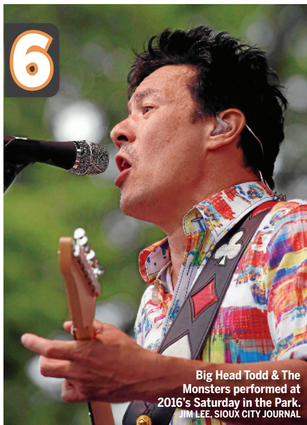
Big Head Todd & The Monsters performed at 2016's Saturday in the Park.

Is the Akron, Iowa, band Diamond Avenue the real deal or is it simply cubic zirconia? Find out at DOXX Warehouse Bar, 1219 Fifth St. at 9 p.m. Saturday.