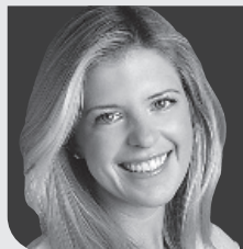
DEAR ANNIE ANNIE LANE