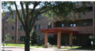
SHIRE I & II APTS (64 units) 1 BR Apts 4236 Hickory Lane, • Sioux City, IA 51106 62 yrs of age or older or persons with disabilities.