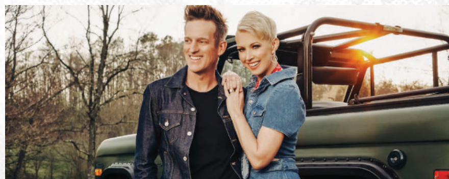
THOMPSON SQUARE [COUNTRY]