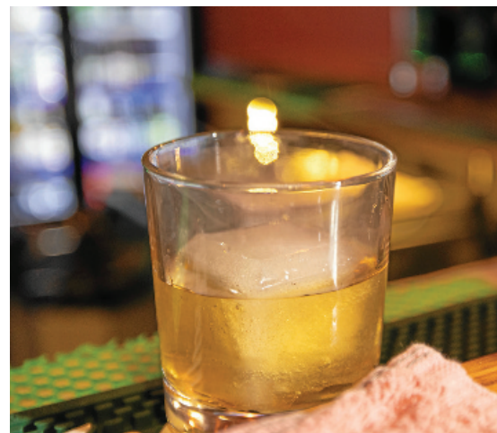
A smoked Old Fashioned drink.

Fashioned, which is made with Bulleit Bourbon, simple syrup and orange bitters before being smoked with cherrywood.