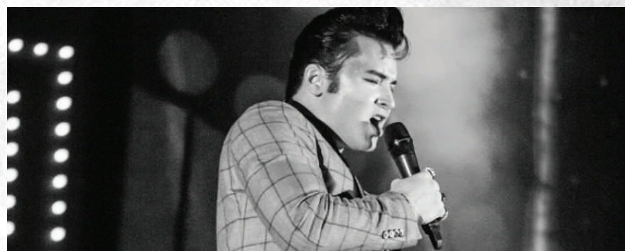
ONE NIGHT WITH THE KING [ELVIS TRIBUTE]