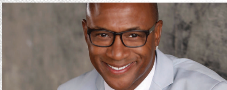
TOMMY DAVIDSON [COMEDY]