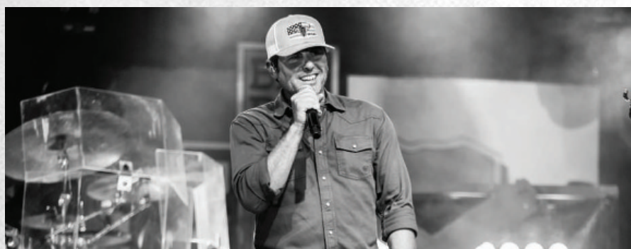
CASEY DONAHEW [COUNTRY]