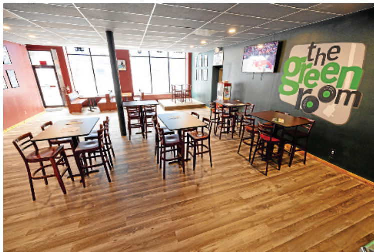
A green room is traditionally the place where an entertainer can chill between performances. However, you don't need to be a celebrity to enjoy The Green Room, a new bar at 1227 Fourth St.

Pizzas (or what The Green Room calls "Pizzaz") come in some varieties as Traditional (pepperoni, hamburger and a homemade