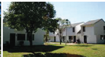
SOUTHVIEW APTS (32 units) 2 and 3 BR Apts 2728 South Helen St. • Sioux City, IA. 51106