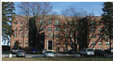
FLOYD VALLEY APTS (59 units) 1 BR Apts 110 6th Ave NE • LeMars, IA 51031