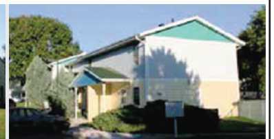
TOWNVIEW APTS (32 units) 2 and 3 BR Apts 400 West 4th St. • Sioux City, IA. 51103