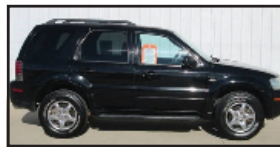
2005 MERCURY MARINER PREMIER, 3.0 V-6, PW, PL AUTO (NEW TRANSMISSION) CALL 712-540-4400