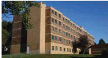
CENTENNIAL MANOR APTS (80 units) 1 BR Apts 441 West 3rd St. • Sioux City, IA. 51103 62 yrs of age or older or persons with disabilities.