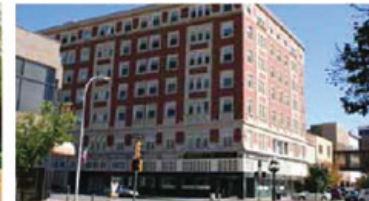
MARTIN TOWER APTS (86 units) 1 BR Apts 410 Pierce St. • Sioux City, IA. 51101 62 yrs of age or older or persons with disabilities.