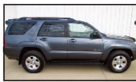
2004 TOYOTA SR-5 4-RUNNER V-8, AUTO, SUNROOF, PS, PL, A/C CALL 712-540-4400