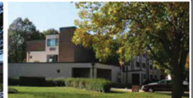
RIDGEWOOD APTS (36 units) 1 BR Apts 260 South 4th St. • Akron, IA. 51001 62 yrs of age or older or persons with disabilities.