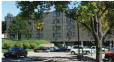
CENTURY II APTS (80 units) 1 BR Apts 515 Court St. • Sioux City, IA. 51101 62 yrs of age or older or persons with disabilities.