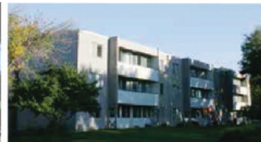
WEST PARK APTS (51 units) 1 BR Apts 605 W. 3rd St. • Sioux City, IA. 51103 62 yrs of age or older or persons with disabilities.