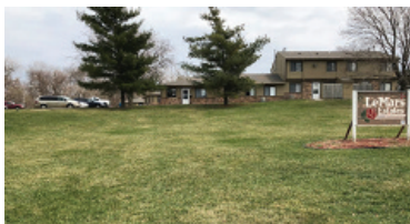
LE MARS ESTATES APTS ( 31 units) 2 and 3 bedroom town-home style apartments 650 4th Ave. NE • Le Mars, IA 51031