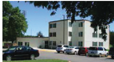
SOMERSET APTS (24 units) 1 BR Apts 400 Minnesota Ave. • Holstein, IA. 51025 62 yrs of age or older or persons with disabilities.