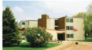
KINGSTON APTS (24 units) 1 BR Apts 315 E. 4th St. • PO Box 183 Kingsley, IA. 51028 62 yrs of age or older or persons with disabilities.