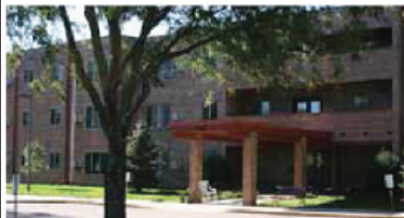
SHIRE I & II APTS (64 units) 1 BR Apts 4236 Hickory Lane, • Sioux City, IA 51106 62 yrs of age or older or persons with disabilities.