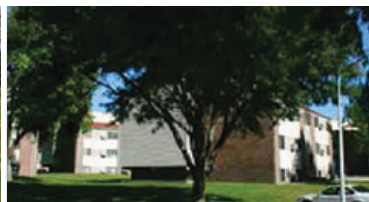
MORNING HILLS APTS (96 units) 1, 2, and 3 BR Apts 2627 South Rustin St. • Sioux City, IA. 51106