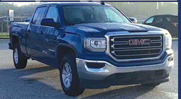
2018 GMC SIERRA 1500 SLE 4wd, Crew Cab, Heated Seats!!! $31,969