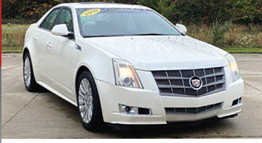
2010 CADILLAC CTS AWD Loaded w/ all Caddy options!!! $14,969