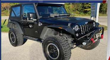
2017 JEEP WRANGLER 2dr, tons of accessories!!! Only 40k $31,969