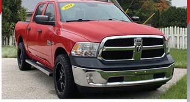
2014 RAM 1500 QUAD CAB 4wd, Hemi, Nice Truck!!! $26,969