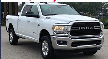
2019 RAM 2500 CUMMINS DIESEL Big Horn, Crew Cab 4wd! $54,969