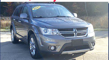
2013 DODGE JOURNEY R/T AWD, Loaded!!!!!! V6 $13,969