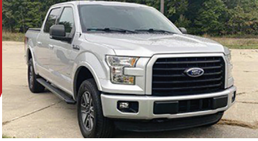
2015 FORD F-150 SUPERCREW FX4 4wd, 3.5L, Clean!!! $28,969