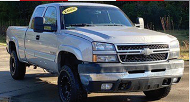
2006 CHEVY SILVERADO 2500 HD Ext. Cab, 4wd, 6.0L V8, Great runner! $6,999