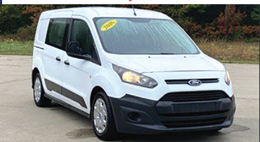
2016 FORD TRANSIT CONNECT XL Cargo w/ accessories! $11,969