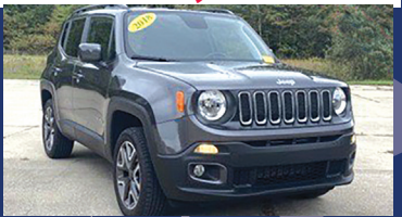
2018 JEEP RENEGADE LATITUDE 4WD, AUTO, LOADED! $22,869