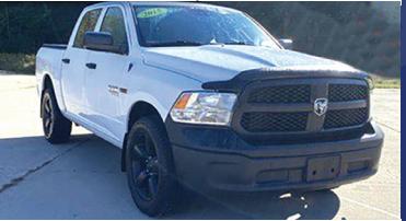
2015 RAM 1500 CREW EcoDiesel, 4wd, Nice MPG!!! $26,969