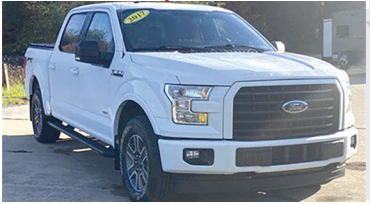
2017 FORD F-150 SUPERCREW Sport, 4wd, 2.7L EcoBoost! $35,969