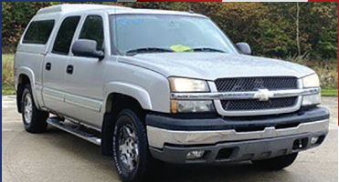
2004 CHEVY SILVERADO CREW CAB 4wd, new tires, drives great! $2,999