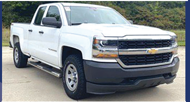
2016 CHEVY SILVERADO 1500 4X4, 5.3, V8, Dbl Cab $26,969