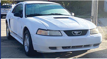
2001 FORD MUSTANG Only 111K, auto!!! $4,969