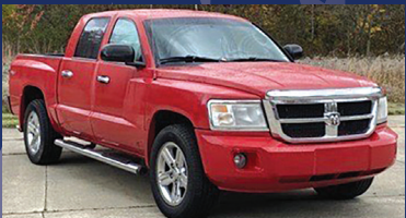
2008 DODGE DAKOTA CREW CAB 4x4, auto, V8, Only 70,000 Miles!!! $13,969