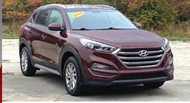
2018 HYUNDAI TUSCON SEL AWD, Loaded!!! $21,969