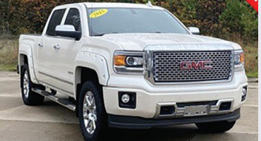
2015 GMC SIERRA DENALI 4wd, Crew Cab, loaded w/all options!! $29,969