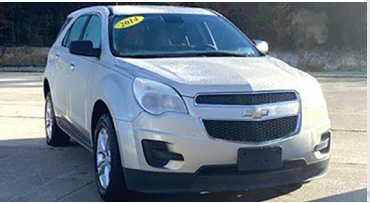
2014 CHEVY EQUINOX LT AWD, Fresh Trade!!! $10,969