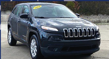
2014 JEEP CHEROKEE SPORT Loaded w/options! Fresh trade! $14,469