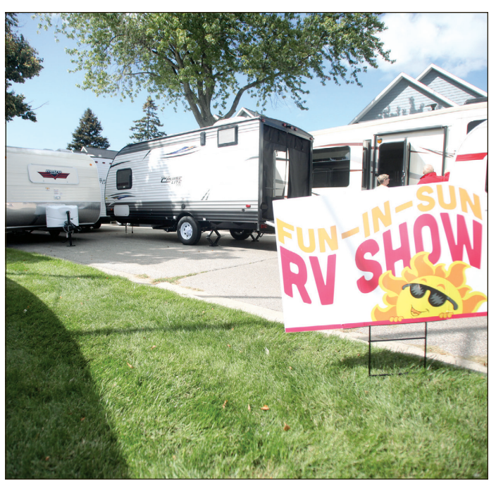
Fun-N-Sun's display had several campers at the 2016 Western Michigan Boat, RV, Home and Outdoor Show.

"We'll have a lot to choose from," he said. "And if they want to see more, we're only four miles away with (more than) 200 units in inven-