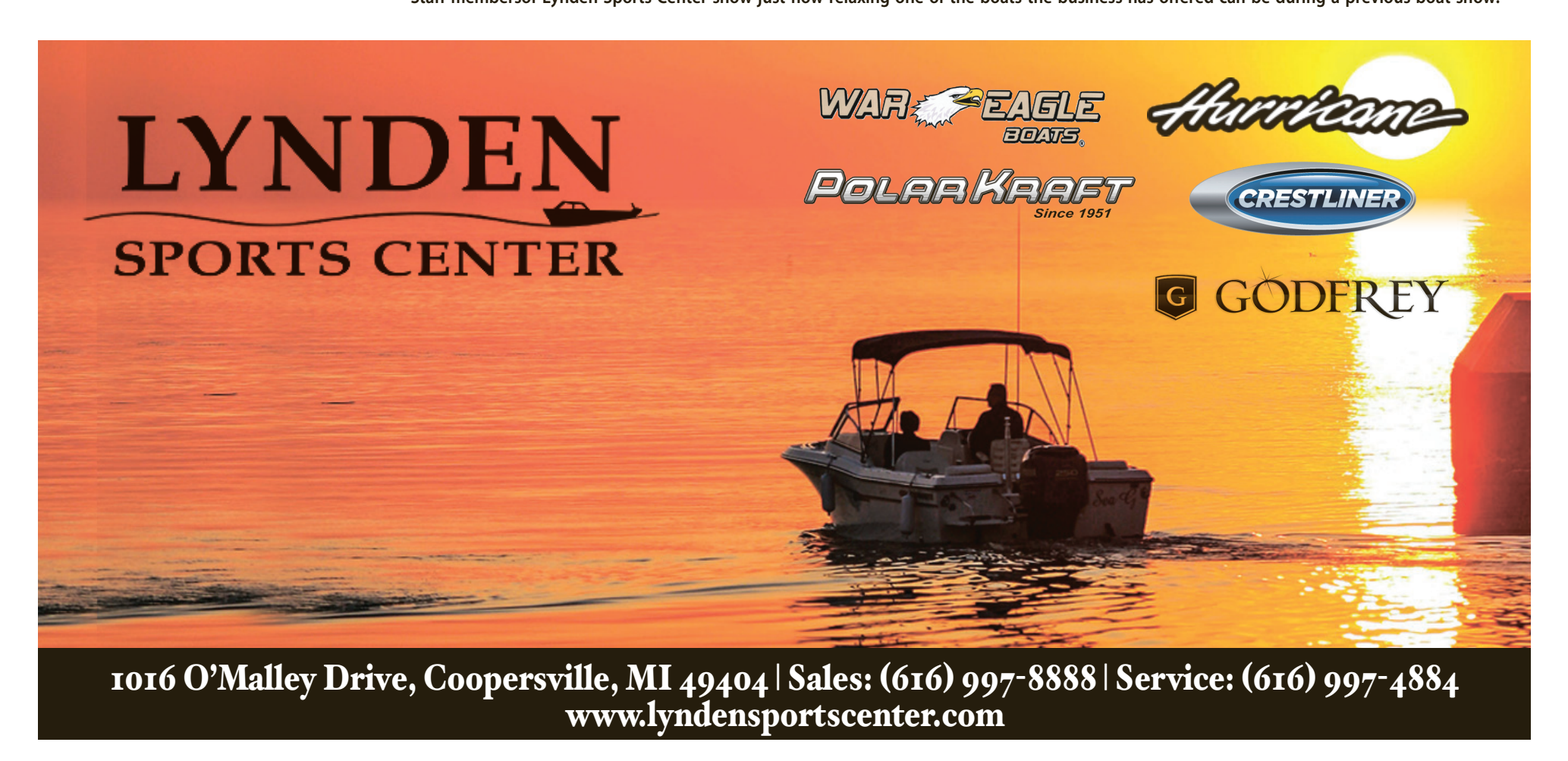
Staff membersof Lynden Sports Center show just how relaxing one of the boats the business has offered can be during a previous boat show.