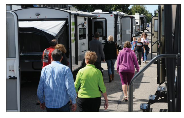
Campers and RVs will be on display at the show.

This image from a drone shows boats lined up along William Street near the Ludington Municipal Marina. The third Western Michigan Boat, RV, Outdoor and Home Show will be Friday through Sunday, Sept. 6-8.