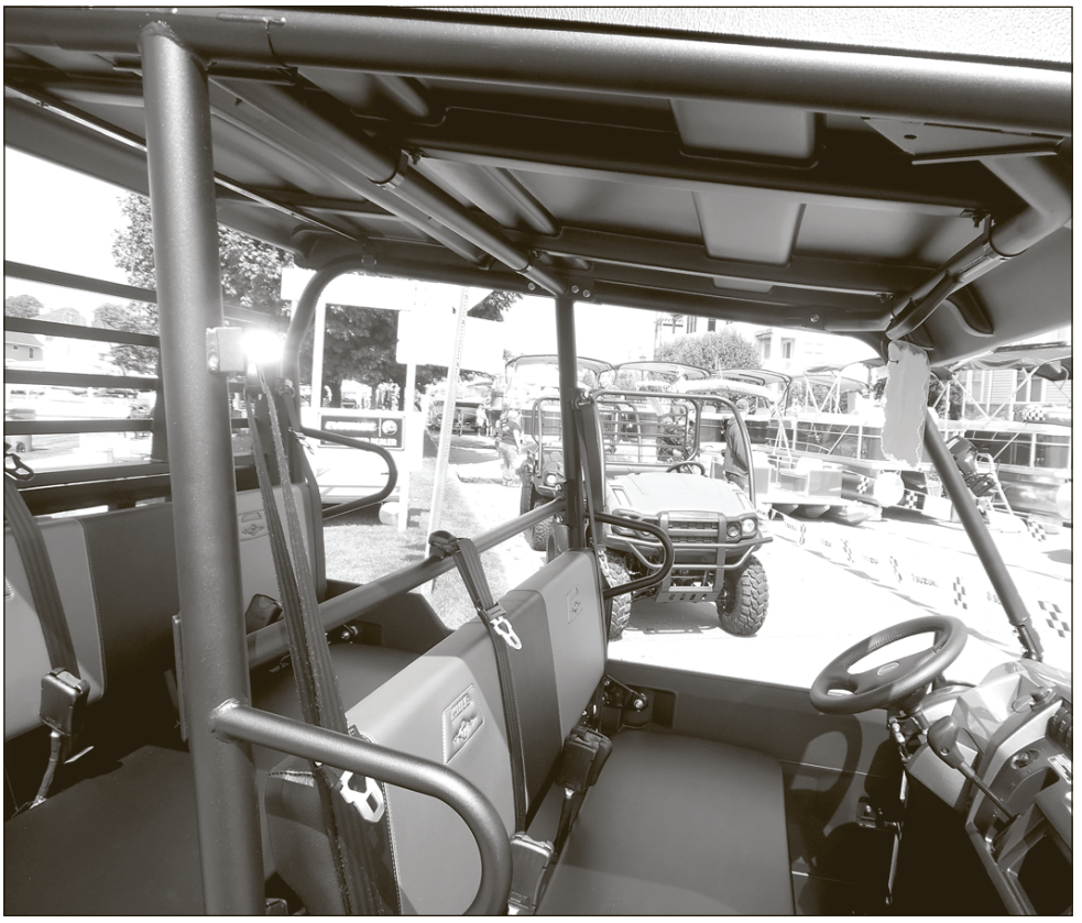
ATVs line the streets and grass near the Ludington Municipal Marina at the 2017 Western Michigan Boat, RV, Outdoor and Home Show.