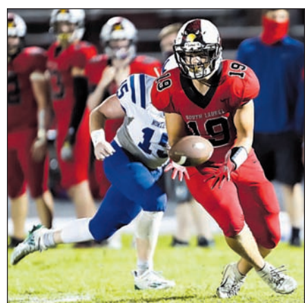
The South Laurel Cardinals averaged 25 points per game on offense last season while scoring 30 points on four occasions.