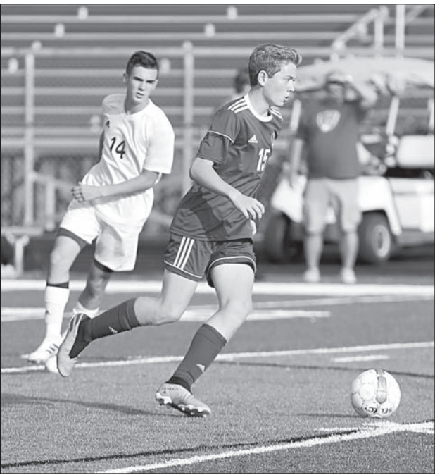
North Laurel posted a 2-9-1 last season.