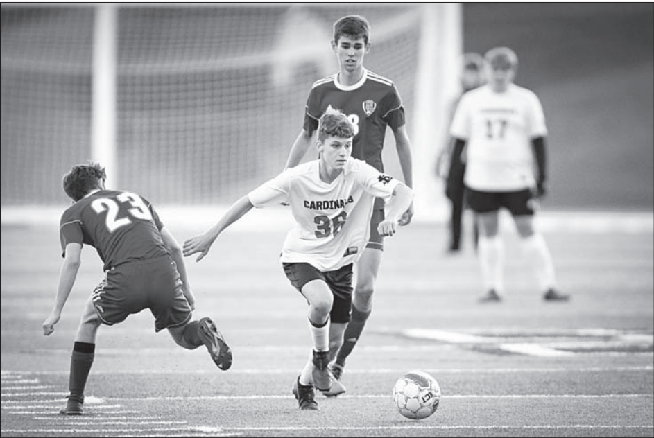
South Laurel finished with an 8-8 record last season.