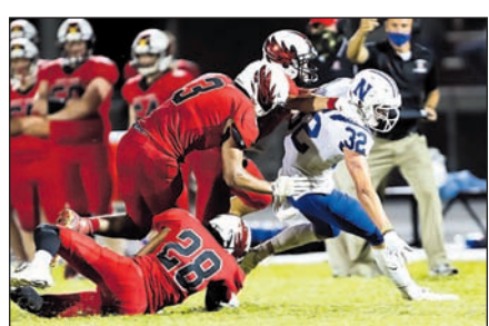
Defensively, South Laurel struggled last season, allowing almost 52 points per game. The lowest point total the Cardinals allowed last season was 42 against Mercer County. Teams scored at least 50 points or more five times last season, including Whitley County's 69-point scoring effort.

In 2005, he had just led the Cardinals to a playoff win, and now, he's taking over a program that was ranked last in the 2020 Class 5A RPI rankings and is riding a 14-game losing