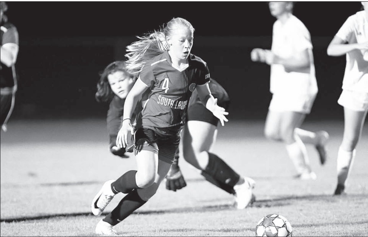
South Laurel posted a 2-10-1 record last season.