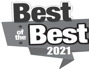
Boats, Boating Store Pittsburg Marine