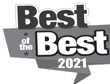
Dance Studio Rhythm Dance