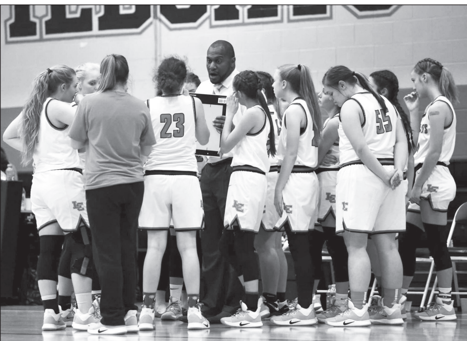
Rodney Clarke's Lynn Camp Lady Wildcats dropped a 58-31 decision to No. 1 seed Knox Central back on Jan. 29.