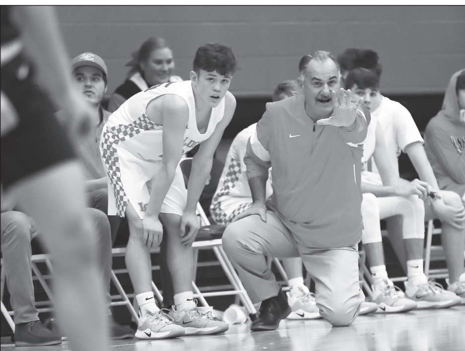
Dinky Phipps' Lynn Camp Wildcats are looking to surprise and make a run in this week's 51st District Tournament.