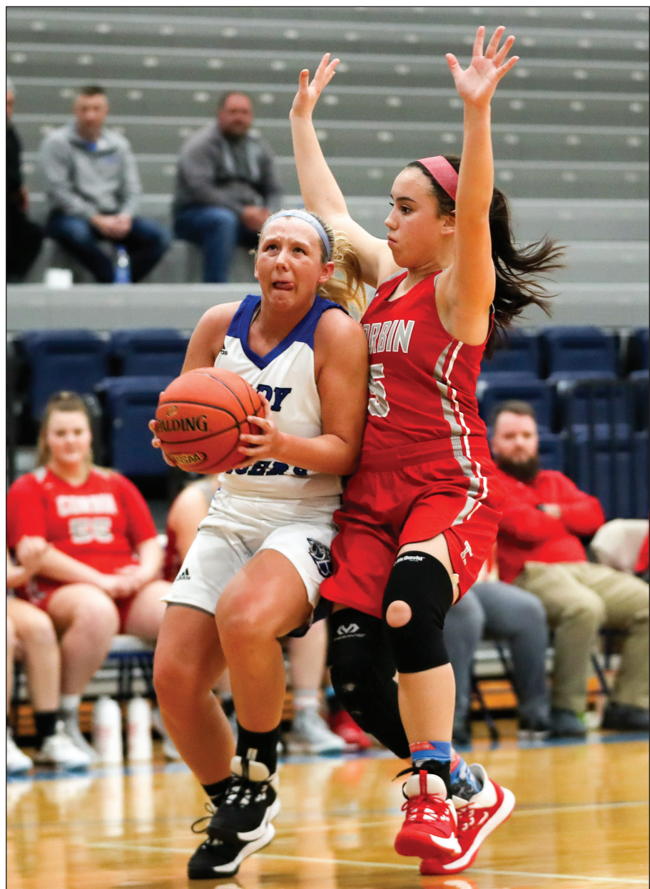
The Barbourville Lady Tigers fell to Pineville earlier in the season, 49-33. | FILE PHOTO