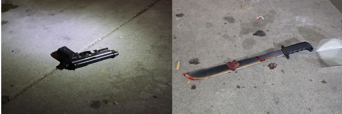
Photos of Amador's pellet gun and machete taken by SBSO forensic team in the parking lot of the Circle K during their investigation of the shooting on December 29, 2023.

Following Amador's death, SBSO investigators spoke to Amador's family and girlfriend. They learned Amador's brother had died approximately two years earlier. They also learned that on the night of the Circle K robbery, Amador had sent some suicidal text messages. Investigators obtained a search warrant for Amador's phone and found the following relevant text messages: