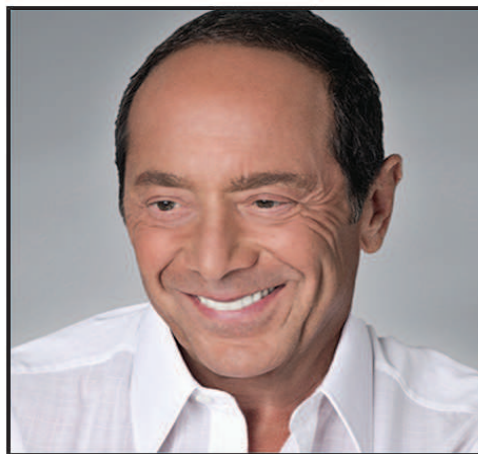
PAUL ANKA 60 YEARS OF HITS - HIS WAY! MAY 2