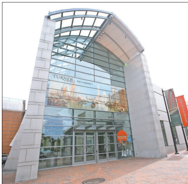
The Peabody Essex Museum in Salem is renowned for its art, culture and history.