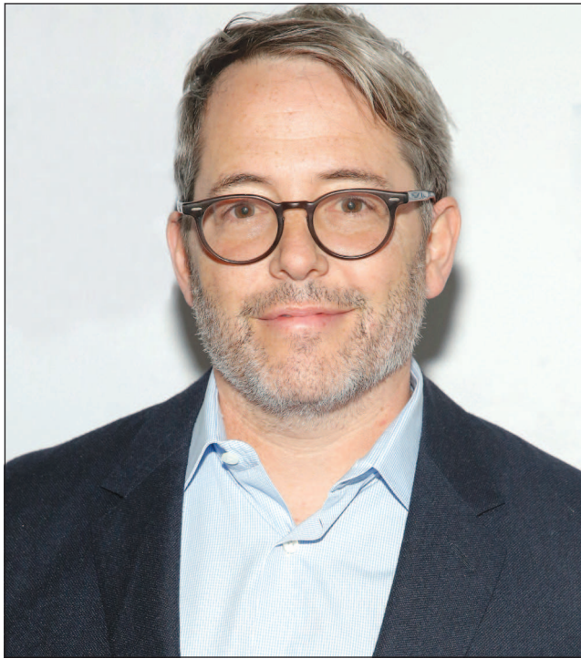
Matthew Broderick narrates “A Christmas Story Live!”

Clark’s “A Christmas Story” did moderately well when it opened in theaters