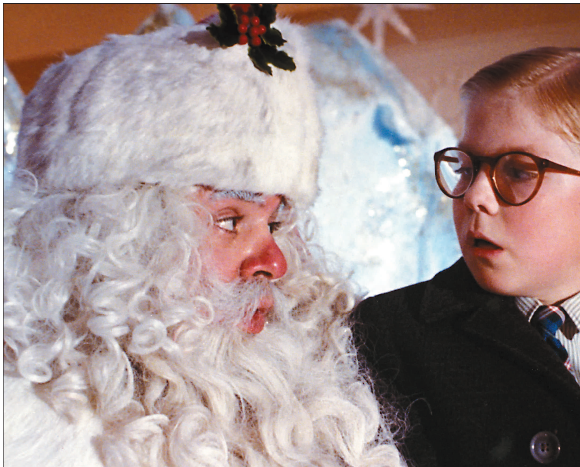
Jeff Gillen and Peter Billingsley in a scene from 1983's "A Christmas Story"

Benj Pasek and Justin Paul have signed on to work on the production as well, which is fitting since they were responsible for the score of "A Christmas Story: The