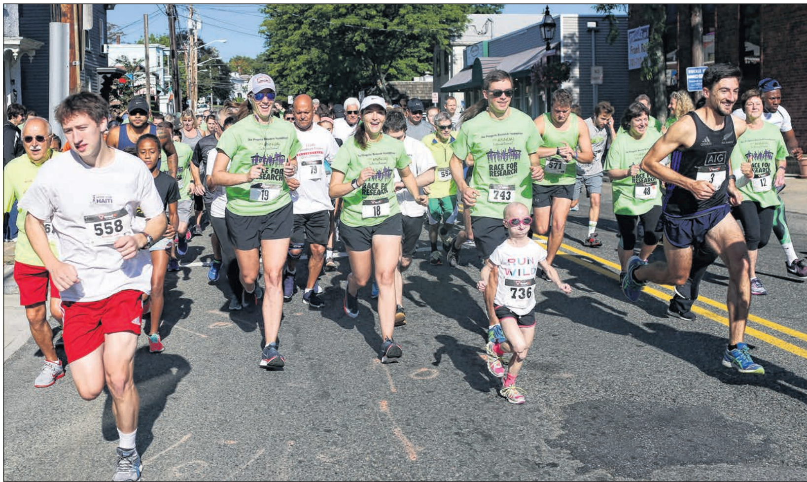
The 16th Annual International Race for Research gets underway in downtown Peabody in 2017. The annual race benefits the Progeria Research Foundation. This year's race is set for Sept. 14.