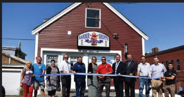
September 2021 Ribbon Cutting North Shore Barber Supply (Shared store front - W/Barber Shoppe Off The Square)

13 Rear Main Street, Lower Lever Peabody, MA 01960 978-587-6056