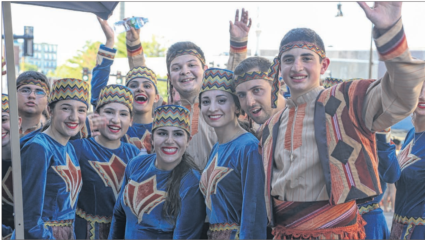
Members of the Sayat Nova Armenian dance troupe at the International Festival in 2016.