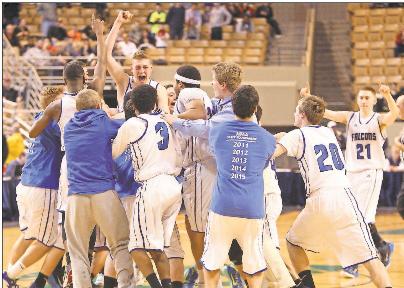
The Danvers Falcons storm the DCU Center court in Worcester after winning the Division 2 state championship over Marlboro.