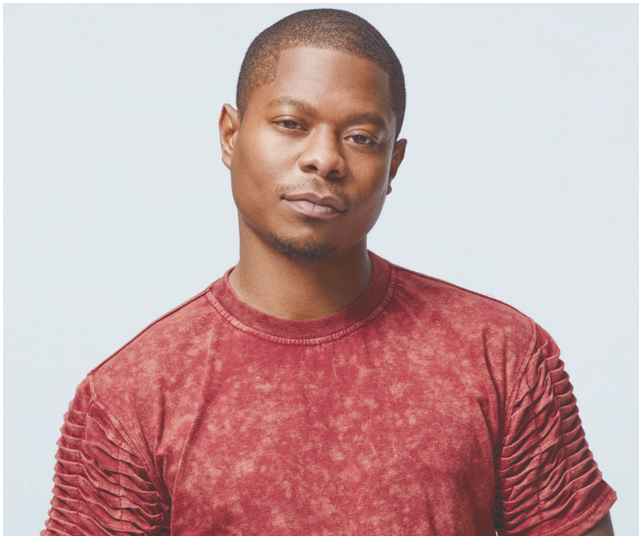
Jason Mitchell stars in "The Chi"