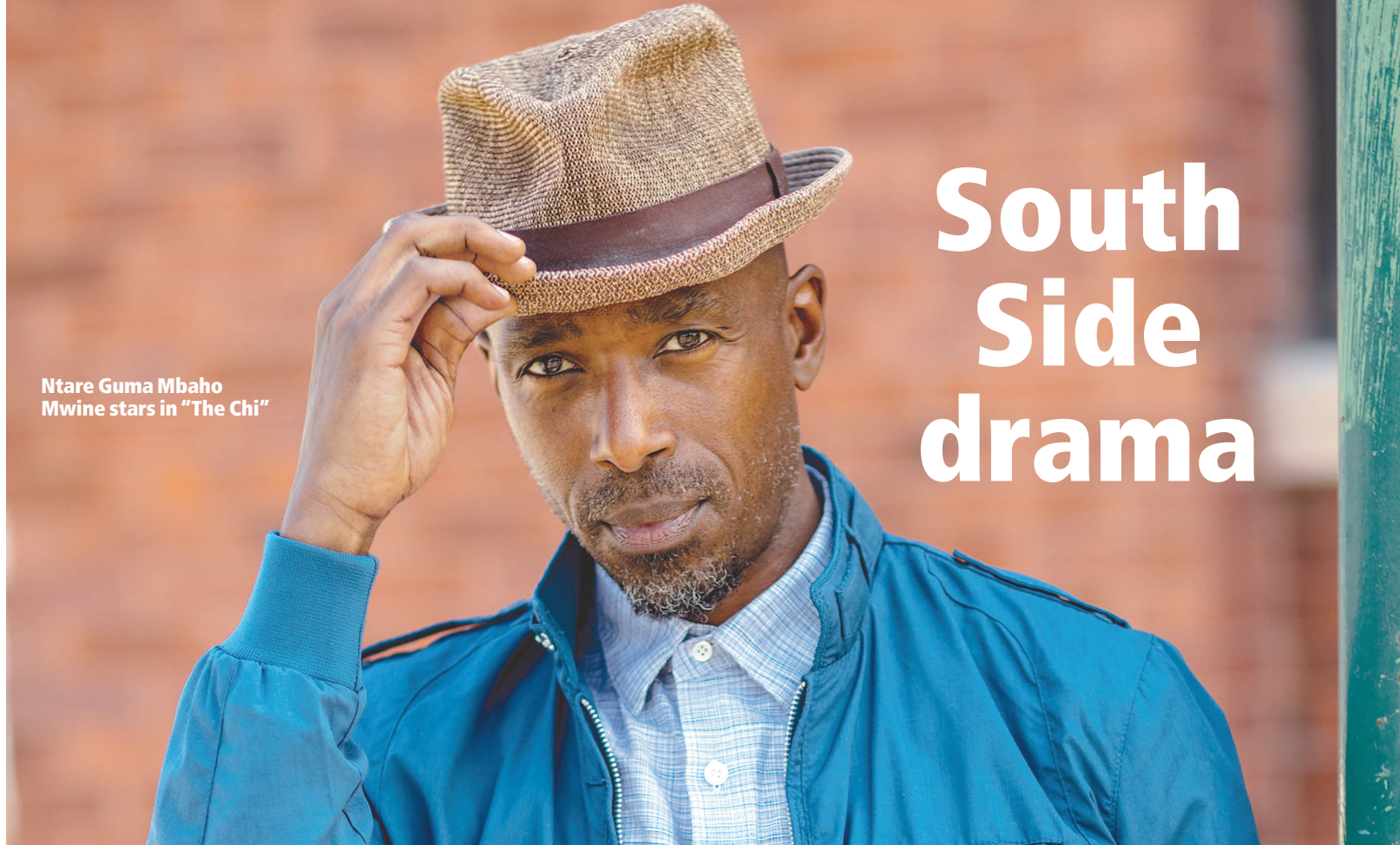
Ntare Guma Mbaho Mwine stars in "The Chi"

Your Weekly Guide to TV Entertainment for the week of January 27 - February 2, 2018