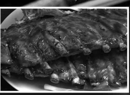
FAMOUS MARINADES Sirloin Tips | Boneless Chicken Boneless Pork | Wings & Thighs

MEATS Full Line of Packaged & Custom-Cut Meats