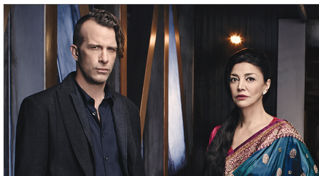
Thomas Jane and Shohreh Aghdashloo star in "The Expanse"

Alongside Jane and Strait, the ensemble includes Oscar-nominated and Emmy-winning actress Shohreh Aghdashloo ("House of Sand and Fog," 2003), Chad L. Coleman ("The Walking Dead," "The Wire"), Wes Chatham ("The Help," 2011), Gemini Award nominee Cas Anvar ("The Tournament") and Dominique Tipper ("Vampire Academy," 2014).