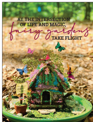
STORY BY LINDSEY GIERE