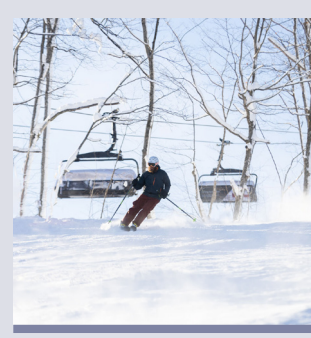
THE HIGHLANDS AT HARBOR SPRINGS

With the recent debut of the amazing Islandwood Skyline was the biggest addition this year, the Highlands at Harbor Springs has been a big success story for the resort. The Highlands is a 100-acre resort with 100 rooms, 100 acres of golf course, and 100 acres of beautiful views.