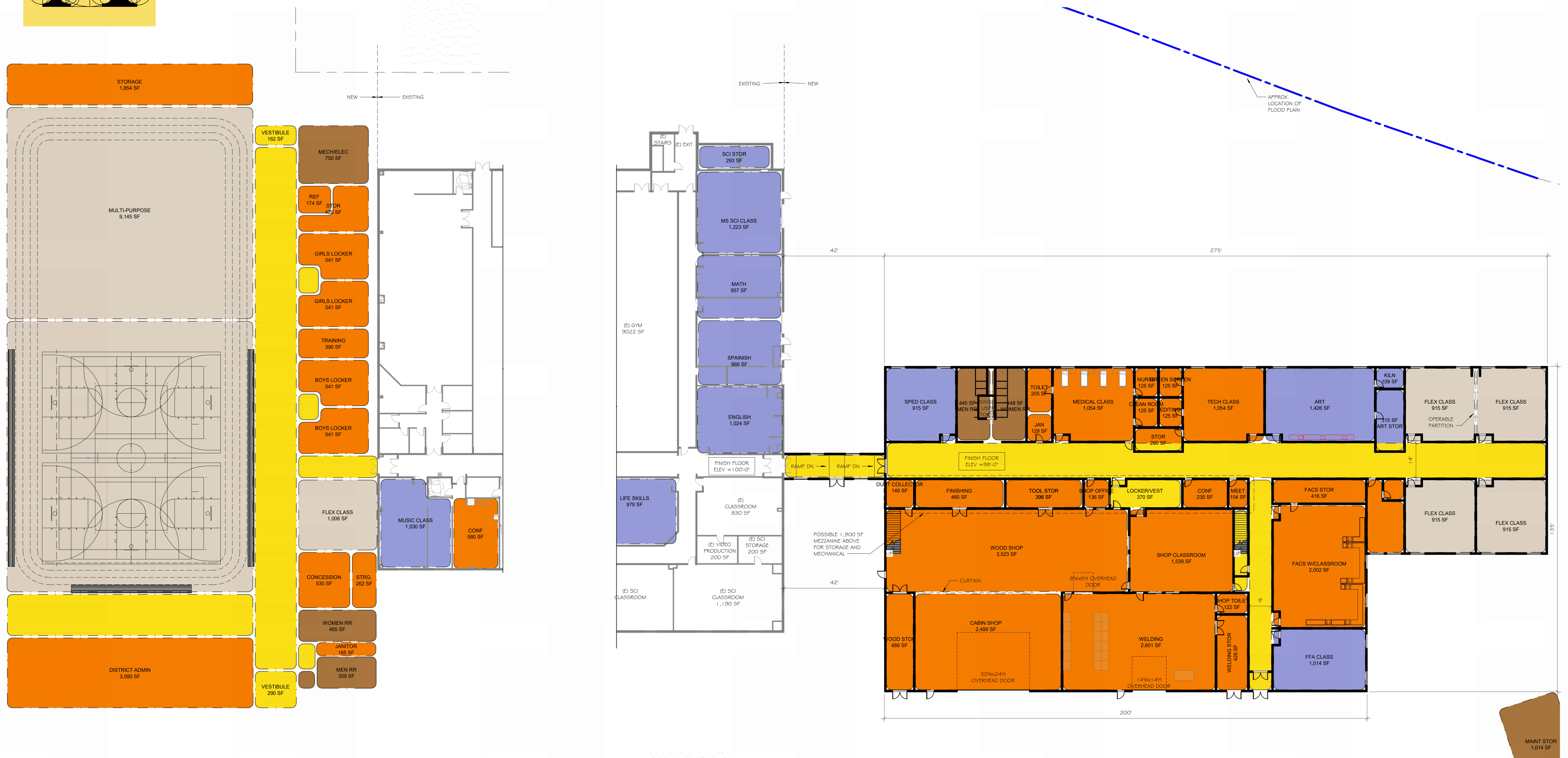
CONCEPT PLAN 2.8