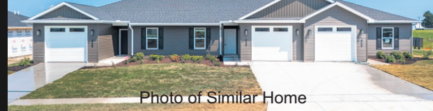
Photo of Similar Home