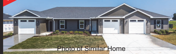
Photo of Similar Home