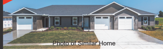
Photo of Similar Home