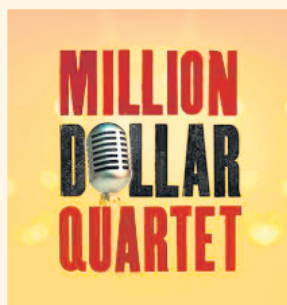
Million Dollar Quartet June 11-12 Includes Lake Geneva Luncheon Cruise