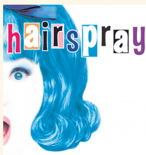
Hairspray the Musical April 30-May 1 Includes a Mystery Stop

Tours Include: Transportation, Host, Accommodations, Show & Meal