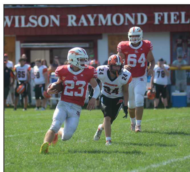
PARKER O'BRIEN/ADIRONDACK DAILY ENTERPRISE

— Chazy 6, Lake Placid 0 CCS 4 2 — 6 LP 0 0 — 0 First half- 1, CCRS, Moser (Dudyak), 32:57. 2, CCRS, McAfee, 33:11. 3, CCRS, Merrill (Moser), 36:54. 4, CCRS, Jarus (Merrill), 39:41. Second half- 5, CCRS, Labarge (Merrill), 2:24. 6, CCRS, Labarge (Merrill), 13:37. Shots- Chazy, 27-6. Saves- Foster, CCRS, 6. Deforest, LPCS, 15.